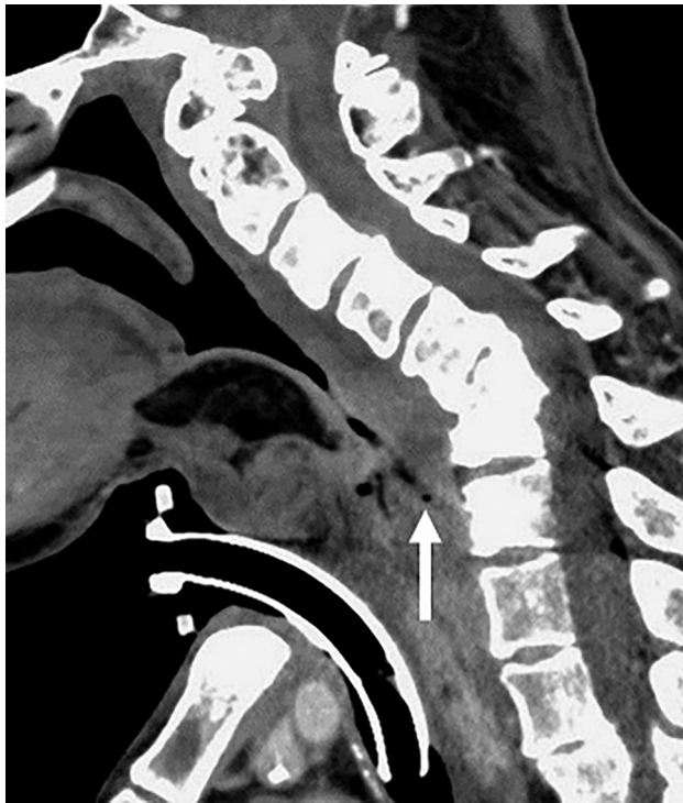
FIG 1. A 51-year-old man with a history of laryngeal SCCA, treated with total laryngectomy and myocutaneous flap reconstruction. Sagittal contrast-enhanced CT demonstrates marked prevertebral soft-tissue thickening from C4 to T1 and chronic fracture/dislocation at C6–C7. A bulky myocutaneous flap reconstructs the anterior pharyngeal wall; note how lumen tapers, terminating at C7. A tiny locule of extraluminal air is present in the prevertebral soft tissues just anterior to the T1 superior endplate ( arrow ).