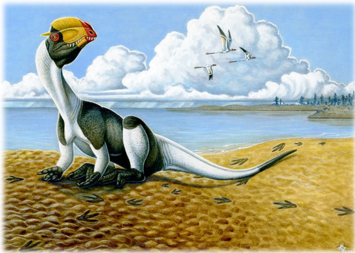
The large theropod dinosaur Dilophosaurus resting on the Lake Dixie beach to create a Eubrontes crouching trace with hand impressions. The actual crouching trace specimen can be seen at the St. George Dinosaur Discovery Site at Johnson Farm.