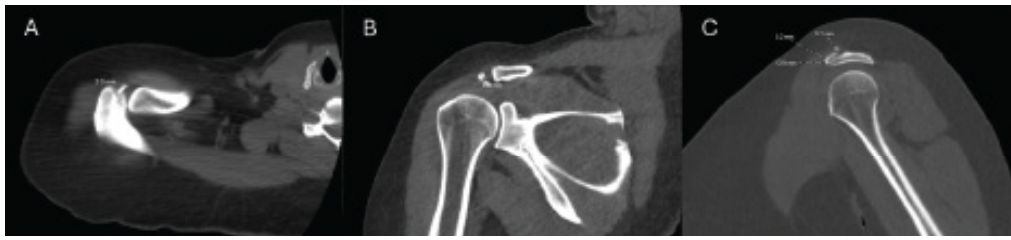
Image 2. Computed tomography imaging without intravenous contrast of the right shoulder demonstrating A) axial, B) coronal, and C) sagittal series. A 13x3x5 millimeter calcific deposit overlying the anterior aspect of the acromioclavicular joint adjacent to the acromion consistent with hydroxyapatite deposition disease (dotted lines) is seen. No fracture or dislocation was visualized.

A shoulder sling was applied, and the patient was discharged with an ambulatory referral to orthopedic surgery and prescriptions for naproxen, orphenadrine, and hydrocodone-acetaminophen.