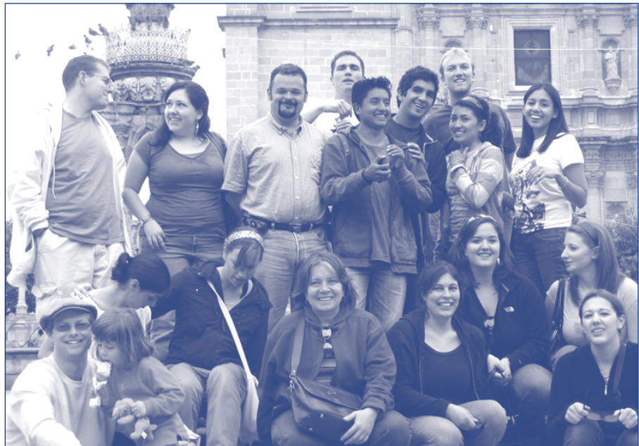
25 UCSD undergraduate and graduate students participated in the Mexican Migration Field Research and Training Program in Jalisco, Mexico.

worked in groups on writing drafts of chapters to produce a final manuscript. Next year, students will conduct research in a new site in Oaxaca, Mexico. ■