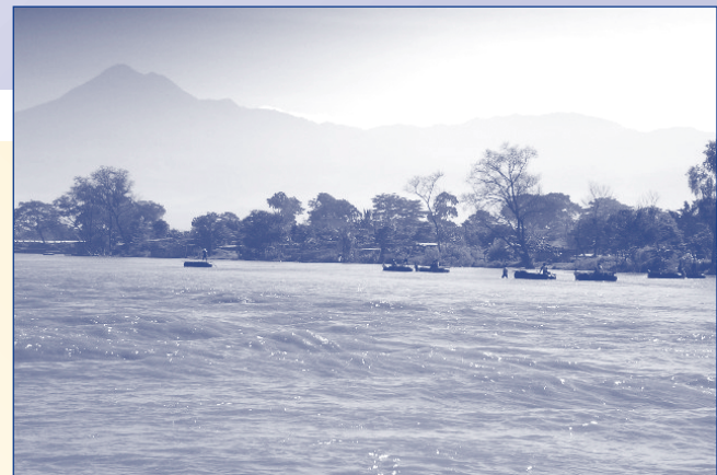
Undocumented Mexico/Guatemala border crossing on the Rio Suchiate

Migrante', a safe house that provides room and board to migrants for three days. I immersed myself in the world of transit migration, and engaged with migrants during their respite from their dangerous journey through Mexico. This provided an important human perspective to a policy issue. My fieldwork proved to be an enriching and intense academic and personal experience. ■