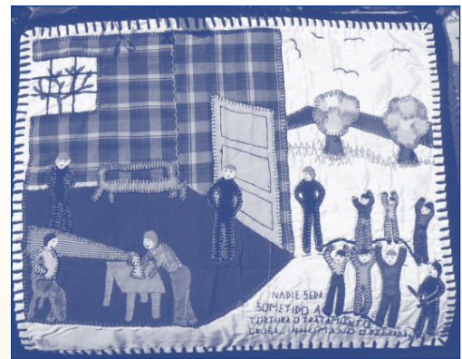
Chilean Arpillera (Curated by Chilean Cecilia Ubilla)