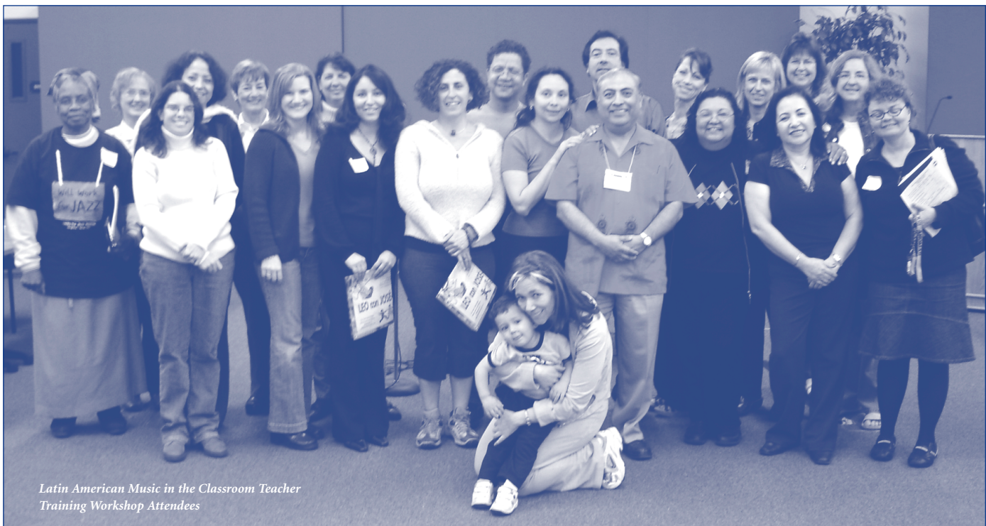
Latin American Music in the Classroom Teacher Training Workshop Attendees