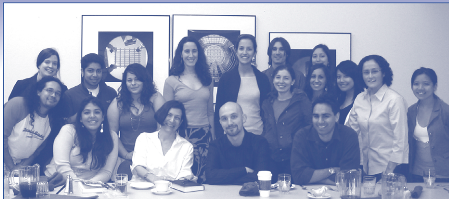
UCSD undergraduate and graduate students had the opportunity to have lunch with esteemed writer Alma Guillermoprieto.

She is the author of Looking for History: Dispatches from Latin America (2001), The Heart That Bleeds: Latin America Now (1994), and Samba (1990), which