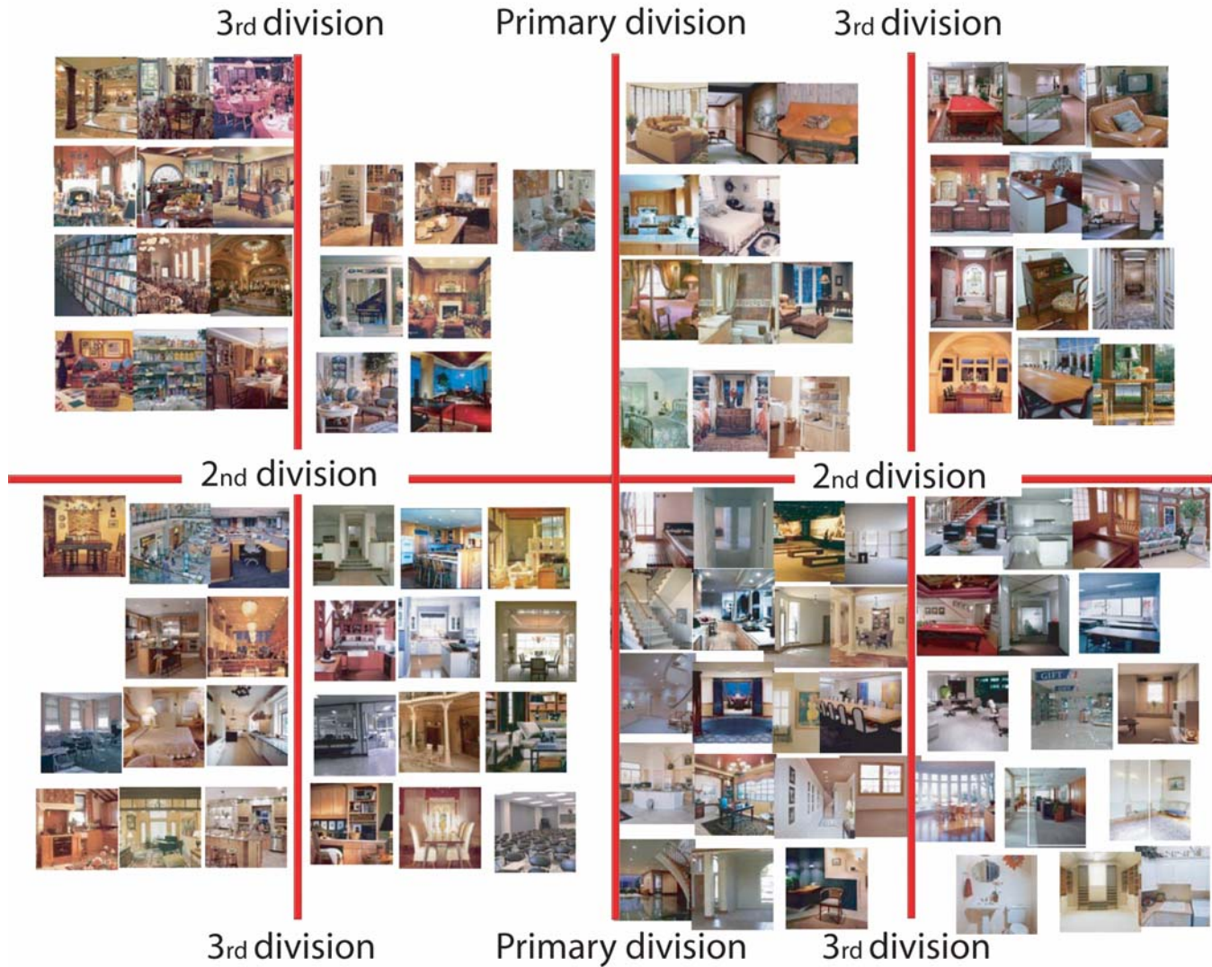
Figure 2: Illustration of the hierarchical grouping task after completion (organization made by subject 1 in the Structure group). Most complex scenes are in the top left corner, and most simple scenes are the bottom right corner.

Torralba, A., & Oliva, A. (2002). Depth Estimation from Image Structure. IEEE Pattern Analysis and Machine Intelligence , 24 (9), 1225-1238 van der Helm, P.A. (2000). Simplicity versus likelihood in visual perception: From surprisals to precisals. Psychological Bulletin , 126, 770-800.