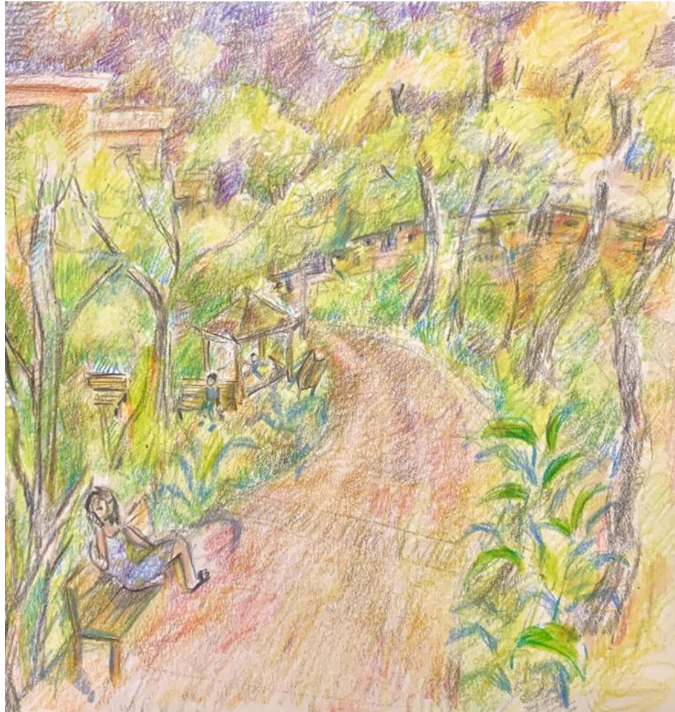
Sanghee Park, <Midnight Phone Call> Whispering Calls at a Good Night Park in a Dense Neighborhood Seoul, September 2022.