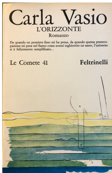
Fig. 2. The first edition of L'orizzonte . Art by Mario Schifano. Reproduced with permission of Feltrinelli Editore.