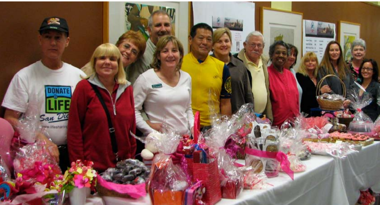
Transplant patients held a bake sale to raise money for the Transplant Olympics.

In their last hour they gave a lifetime.