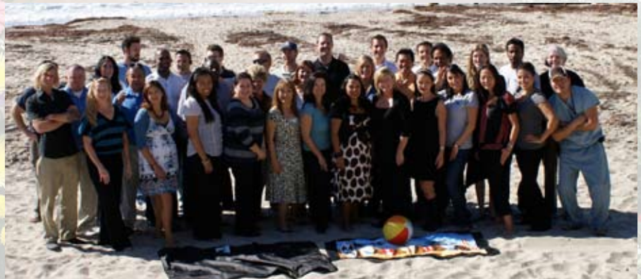
Lifesharing team meeting

to obtain consent for transplant of the organs. Once consent has been obtained, the clinical staff take over medical management of the patient in order to maximize function of all the organs. They implement specialized physiologic management techniques to improve lung and heart function,