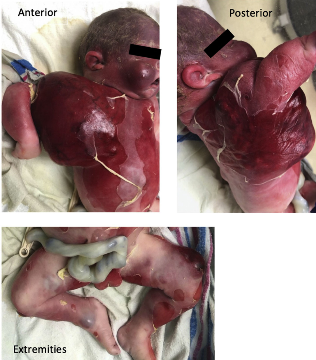
Fig. 2. Stillborn fetus demonstrating multiple subcutaneous nodules, largest arising from the right chest, as well as right cheek and bilateral lower extremities.