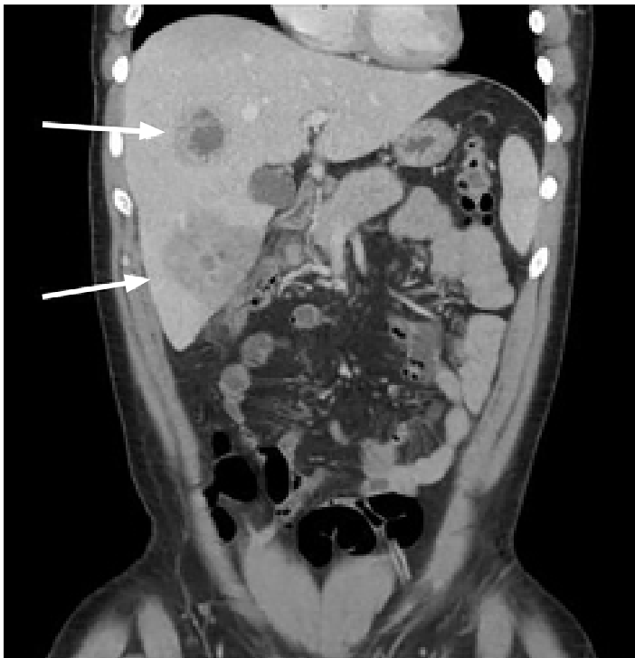
Image 1. Coronal computed tomography of the abdomen and pelvis of 37-year-old male with intermittent fever and vague abdominal pain with hepatic abscess (arrows).

A chest radiograph was negative for signs of pneumonia, after which a computed tomography (CT) of the abdomen and pelvis with intravenous (IV) contrast was obtained, which showed multiple liver abscesses (Image 1), septic