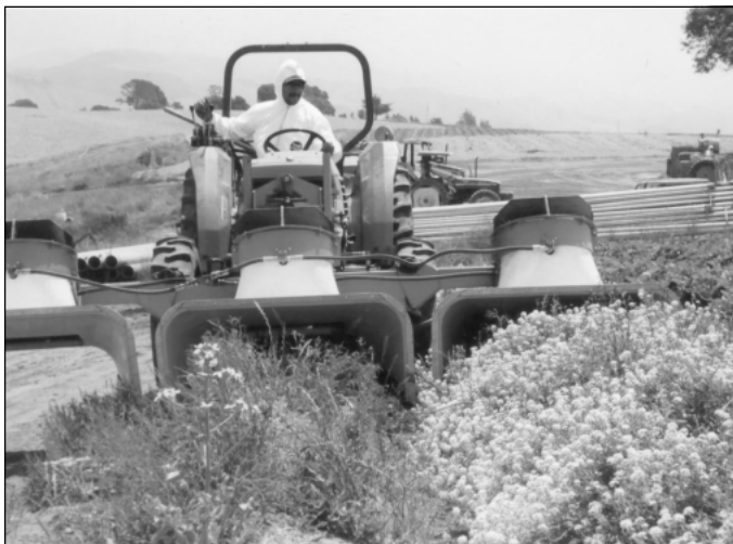
A strawberry ranch employee uses a tractor-mounted "bug vac" to vacuum trap crops adjacent to strawberry fields on a Monterey County ranch.