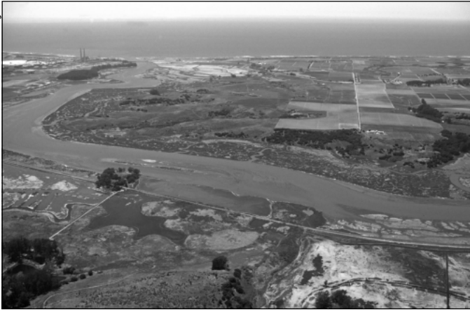
Farmland surrounds Elkhorn Slough's critical wildlife habitats on California's central coast.

The few winners in this scenario—including the five agribusinesses that account for nearly two-thirds of the global pesticide market, almost one-quarter of the global seed market, and virtually the entire transgenic seed market* (Gorelick 2000)—are profoundly outnumbered by its human and non-human losers. Indian scholar and activist Vandana Shiva cautions that “Industrial agriculture has not produced more food. It has destroyed diverse sources of food, and it has stolen food from other species to bring larger quantities of specific commodities to the market, using huge quantities of fossil fuels and water and toxic chemicals in the process” (Shiva 2000).