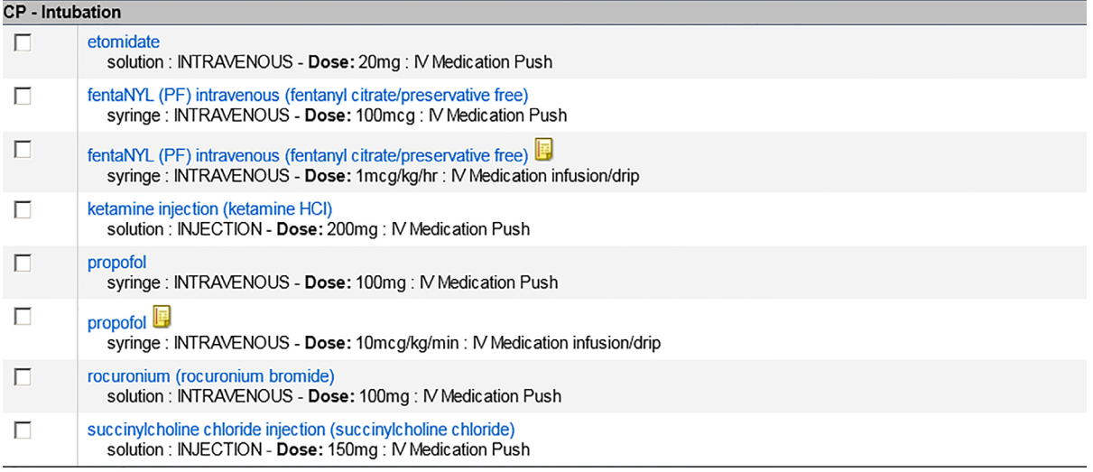
Figure 1. Intubation medication order set (Picis Clinical Solutions© Wakefield, Massachusetts).

The use of opioids and benzodiazepines in the overall sample from 2014-2016 is summarized in Table 2. In 2014, prior to the workflow changes, 41% of mechanically ventilated patients received an opioid, either as an intravenous push (IVP) or as an IV infusion (n=95). In 2015, immediately after the intervention, and in 2016, the later study period, 71% (n=106) and 64% (n=81) of mechanically ventilated patients received an opioid (both p<0.0001). We found significant differences in the percent of patients receiving an opioid IV infusion in 2014 vs. 2015 and 2014 vs. 2016 (both p<0.0001). Specifically, only 29% (n=67)