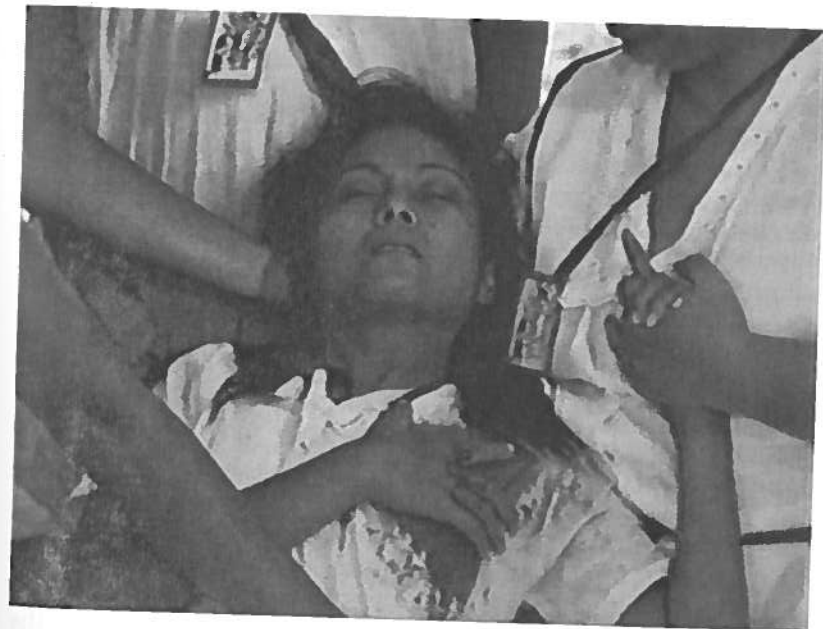
Illustration 9.6 Himala depicts Elsa as a kind of female Christ

Bona's exposition introduces Nora's character as a devotee of the Black Nazarene, one of the many thousands who crowd around the Quiapo saint because its touch is said to heal the sick. The scene abruptly cuts to a shot of Bona's face on the sidelines of a movie set, clearly drawing an analogy between religious and cinematic devotion. Paralleling Bona's opening scene, the closing sequence of Himala likewise highlights the religious resonances of star worship: Elsa's cruciform corpse is carried aloft by a grief-stricken multitude, establishing Nora's character as another dark-skinned Christ figure, albeit a feminine one (Illustration 9.6). Shot in Northern Ilocos with a cast of 3000