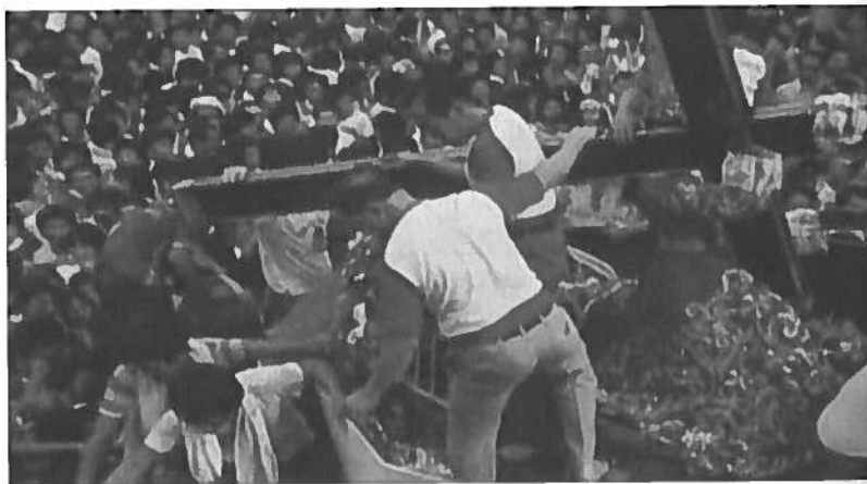
Illustration 9.5 Bona opens with a crowd scene at the Feast of the Black Nazarene in Quiapo, Manila

Unmistakable parallels link the opening scene of Bona to the climactic conclusion of Himala . Bona opens with the January Catholic feast of the Black Nazarene, shot on location in Quiapo, the former commercial and cultural heart of Manila (Illustration 9.5). Brought to the Philippines in the seventeenth century via the Manila-Acapulco galleon trade, the