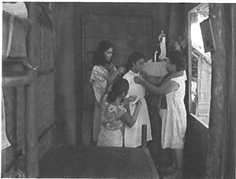
Illustration 9.2 Elsa (centre) is ministered to by a close-knit circle of her most ardent female devotees, or alalay , in Himala

housemaid like herself (Illustration 9.2). Unfolding in a long take and framed at a distance by a static camera, the women get Elsa dressed to meet her growing throng of devotees. The scene alludes to Nora's oft-remarked retinue of alalay , fans admitted into the actress' inner circle, forming part of her entourage and entering formal or informal service in the star's employ. In particular, the characters Chayong and Sepa in Himala are on-screen analogues to diehard Noranian alalay who, according to numerous accounts, eschewed ties to boyfriends, husbands and family members and neglected their jobs to serve their star (Caceres, 2005: 34; Dela Cruz, 2005: 61–63; de Guzman, 2005: x).