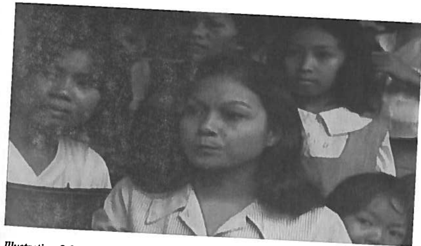
Illustration 9.3 Nora Aunor plays a movie fan in Bona (directed by Lino Brocka, 1980)

Whereas Himala exposes the religious devotion that underpins certain forms of fandom, Bona depicts fan desires carried to an extreme pitch of servility and exploitation. In Himala , the faith healer's aides or alalay – Chayong, Sepa and Aling Saling – play supporting roles; Elsa, the miracle worker-turned-superstar, is the film's central protagonist. In contrast, in Bona , the alalay takes central stage, with Nora playing the title character. Himala is about collective devotion to a charismatic female martyr; Bona is about a solitary female fan who renounces everything for an undeserving male movie extra Gardo (Phillip Salvador), with disastrous results (Illustration 9.3). Conventional translations of the term alalay as assistant, helper or aide (or even the looser interpretation of the term as a member of a star's entourage) fail to capture the menial, servile and feminine connotations that the word often evokes. Yet untenable forms of female exploitation and servitude are precisely at the heart of Bona's portrait of an alalay . Bona is the fan, who, in devoting herself to the unworthy bit-player Gardo is reduced to the status of an unpaid, emotionally abused and sexually available female domestic servant.