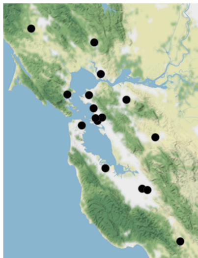
Figure 1. Map displaying the locations of Bay Area Air Quality Management District (BAAQMD) ground-level monitors measuring particulate matter <2.5 \mu\text{m} in diameter ( PM_{2.5} ) that were included in the analysis ( N = 16 ). (Map tiles by Stamen Design, CC BY 3.0).

(3)—that describe air quality for a given geographic area. A score of 0 refers to no wildfire smoke contributing to air pollution, and scores 1–3 theoretically reference PM_{2.5} concentrations attributable to wildfire smoke: light (1), 0–10 \mu\text{g}/\text{m}^3 ; medium (2), 10.5–21.5 \mu\text{g}/\text{m}^3 ; and heavy (3), \geq 22 \mu\text{g}/\text{m}^3 [30,31].