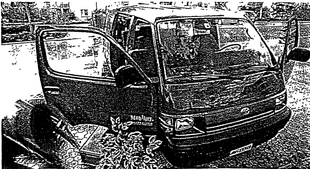
Carsharing satisfies occasional vehicle needs such as carrying several passengers or goods.

and billing. The larger European carsharing organizations (CSOs), especially in Germany and Switzerland, are beginning to deploy a suite of automatic technologies that facilitate the operation and management of services, offer greater convenience and flexibility