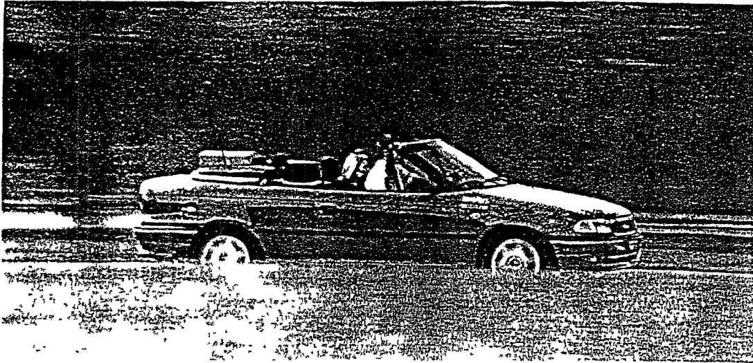
Carsharing allows one to enjoy pleasure driving in a luxury vehicle.

and inconvenient, subject to mistakes in reservations and billing, and vulnerable to vandalism and theft.