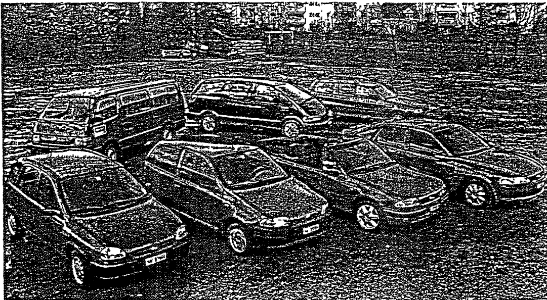
Carsharing provides households and individuals access to a fleet of vehicles on an as-needed basis.

Over the past decade, carsharing has become more common, especially in Europe. Mostly it involves the shared usage of a few vehicles by a group of individuals. Vehicles typically are deployed in a lot located in a neighborhood or at a transit station. Virtually all existing carsharing programs and businesses manage their services and operations manually. Users place a vehicle reservation in advance with a human operator, obtain their vehicle key through a self-service, manually controlled key locker, and record their own mileage and usage data on forms that are stored in the vehicles, key lockers or both. As carsharing programs expand beyond 100 vehicles, manually operated systems become expensive