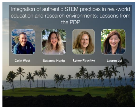
Figure 4: Panel introduction slide at the ISEE conference on Advancing Inclusive Leaders in STEM.

provide a structure to make such interventions both equitable and effective.