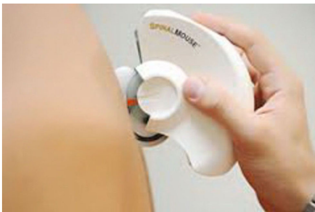
Fig. 3 Measurement of spinal curvature with Spinal Mouse, the device is guided along the midline of the spine from the spinous process of C7 to top of the anal crease (approximately S3)