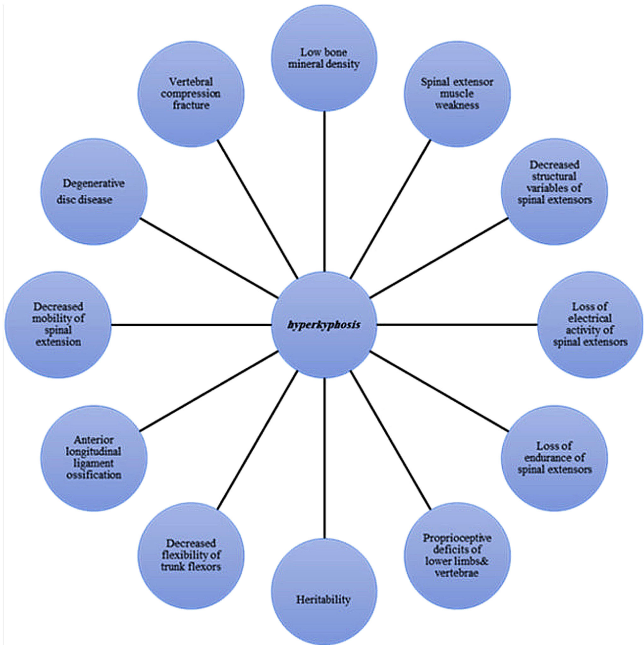
Fig. 4 Postulated causes of age-related hyperkyphosis