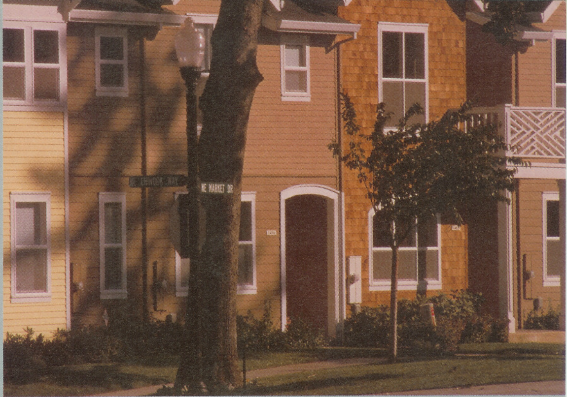
Town houses at Fairview Village

Thus in several significant ways, theory has been put into practice at these two projects. But we must wait to see what sort of community, and what sort of urbanism, emerges in these places.