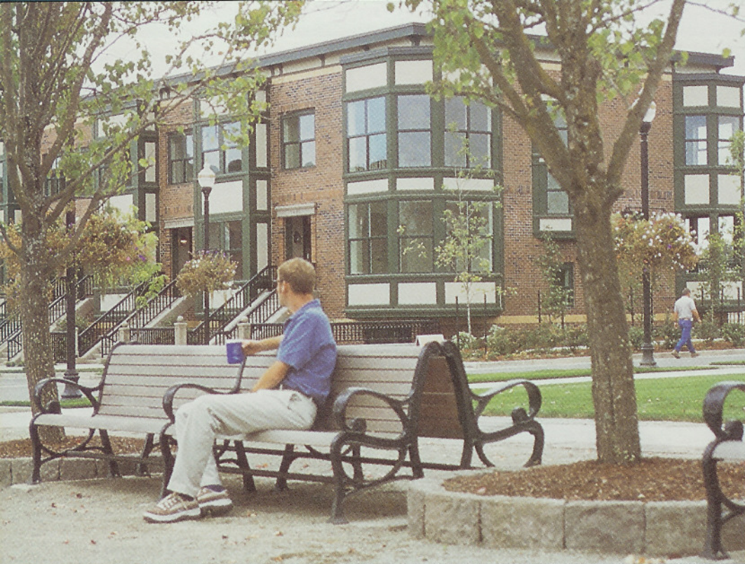
Park at north end of Orenco Parkway in the town center Photo: Fletcher Farr Ayotte Architects

One significant exception here is a pedestrian path that leads from the project's main park to the local elementary school.