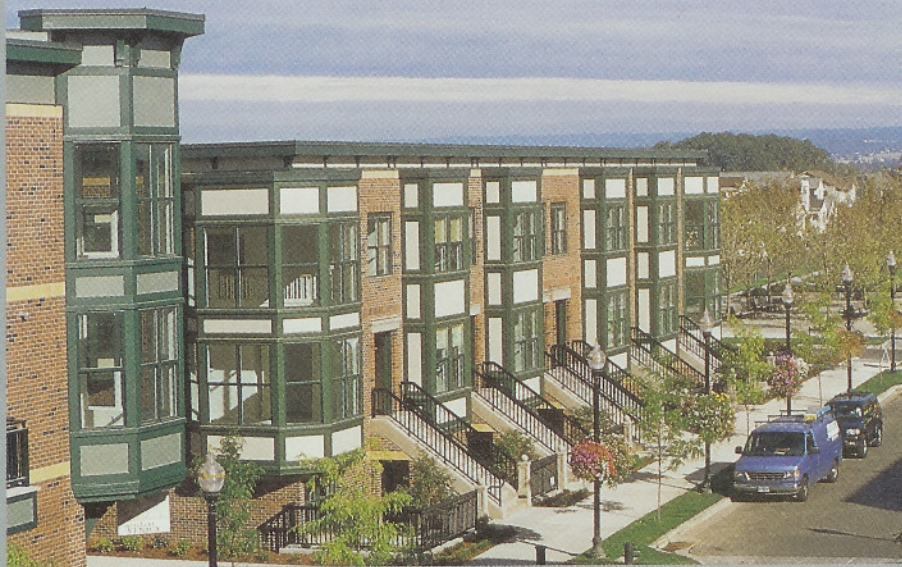
Left: Live-work row houses along Orenco Parkway Right: Retail-residential buildings along Cornell Road Photos: Fletcher Farr Ayotte Architects

Though it incorporates single-family houses, row houses, duplexes, apartments and auxiliary units, prices were relatively high at the time of our visit. Fairview may only attract relatively affluent homeowners who are in different stages of their lives and need different types of housing. The planned construction of a new phase of moderately-priced condominiums may make this community affordable to more people.