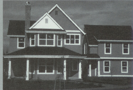
Above: Proposed multifamily housing, Fairview Village. Below: Typical single-family houses, Fairview Village.

Fairview Village, surrounded by high-volume arterial roads and a connector to a nearby freeway, turns inward. Most of the residential and commercial buildings relate to new streets in the interior, and the project's edges are bounded by a wall. Several streets lead across the arterial into existing street system, which extends into the older town of Fairview at the northern edge of the project.