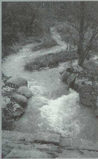
Fairview Village preserved several acres of natural landscape and invested in pedestrian infrastructure.