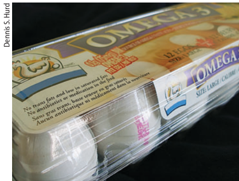
Eggs from chickens that have been fed flax have higher concentrations of omega-3 fatty acids, which have been shown in a number of studies to be beneficial to human health.