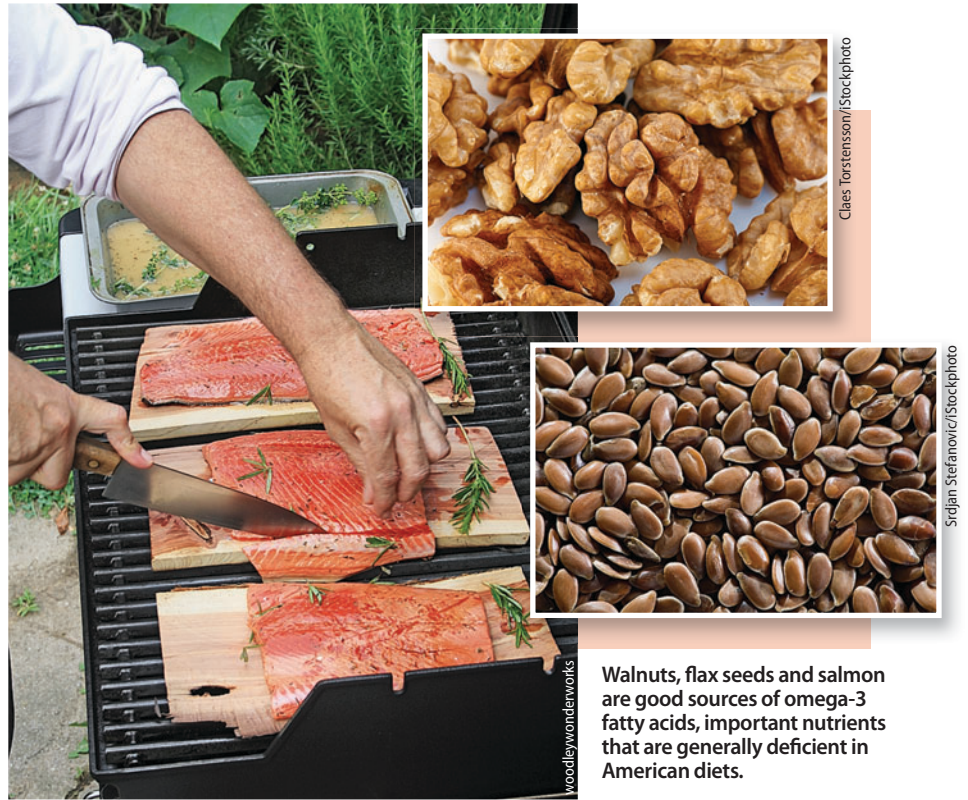
Walnuts, flax seeds and salmon are good sources of omega-3 fatty acids, important nutrients that are generally deficient in American diets.

EPA and DHA attenuate the development of atherosclerosis, or arterial plaques, by reducing concentrations of inflammatory signaling molecules called cytokines and adhesion molecules at the arterial wall where plaque forms (De Caterina et al. 2004). EPA and DHA