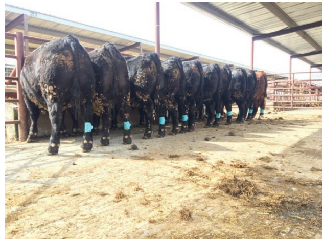
Figure 2. Activity loggers attached to the right hind leg of steers in group pens.

All data were analyzed using the General Linear Model in Minitab (Minitab, Inc., State College, PA) as a repeated measures design, except the logger activity data, which were analyzed using the Proc Glimmix procedure in SAS version 9.4 (SAS Institute Inc., Cary, NC). Models included RFI phenotype (high and low), feed level (ad libitum and restricted), and the interaction of RFI and feed level as fixed effects. Steer was the experimental unit. Residual vs. predicted plots were examined to check the assumption of normality for all models. Least-squares means were compared across periods using a Tukey adjustment. Comparisons were considered statistically significant when P < 0.05 . Results are presented as the least-squares means estimates \pm SE.