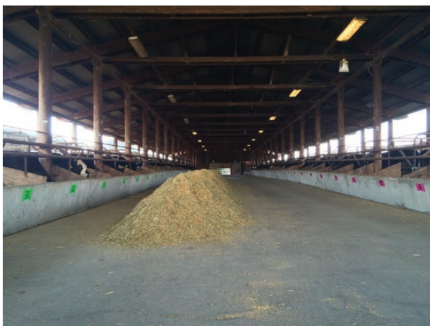
Figure 1. Steers housed in individual pens and TMR stored in the UC Davis trial barn.