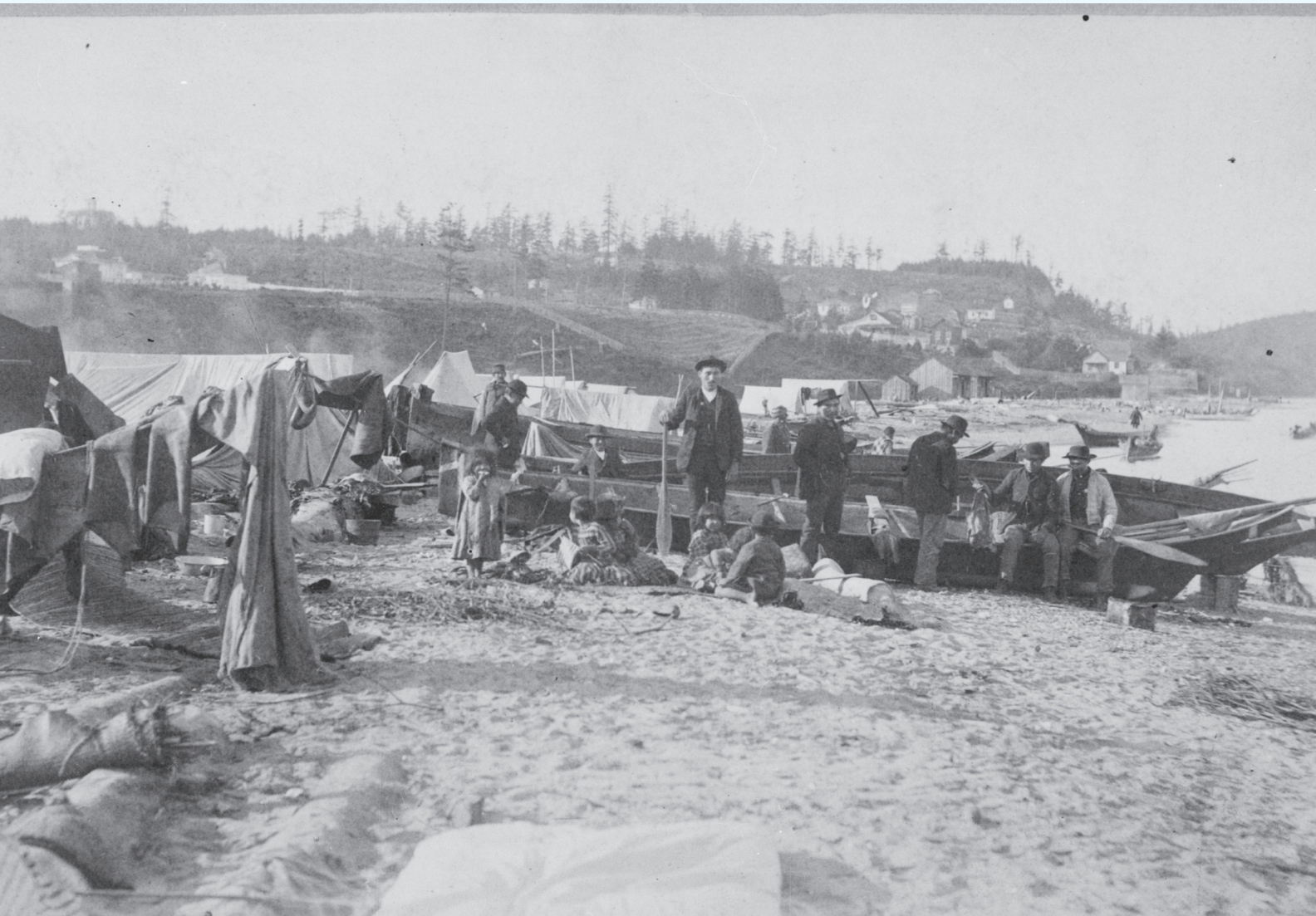
FIGURE 3. Makah tribal members preparing to put out into Puget Sound, ca. 1889. The original caption to the photo reads: “Makah tribe of Indians from Nee-oh Bay resting on the beach at Port Townsend while en route for the hop fields up Pudget-Sound, ca. 1890. The photograph was taken by J. M. McMurry of Port Townsend, Washington Territory.” US Department of Commerce and Labor, Bureau of Fisheries photo. National Archives, Still Picture Records Section, Special Media Archives Services Division (NWCS-S), NAID 513105.

the ocean as a part of their territory (Figure 3), whereas ancient Greeks understood the forbidding “Ocean River” as outside the human realm completely. 11 Until European explorers found sea routes between known and newly discovered lands in the 15th and 16th centuries, people around the globe knew their own coastal area, perhaps the sea it belonged to, or at most two linked ocean basins. 12 Indeed, even scientists have only recently viewed the ocean as a unified whole, as the title of the 2003 Pew Commission report, America’s Living Oceans , suggests. 13 While scientists today insist on the importance of acknowledging one world ocean, this view contradicts historical reality for many, if not most, people around the world and through time. Politically expedient from an environmentalist perspective, the assertion of a singular ocean has enforced a presentist perspective, that is, a view of the past that is dominated by present-day