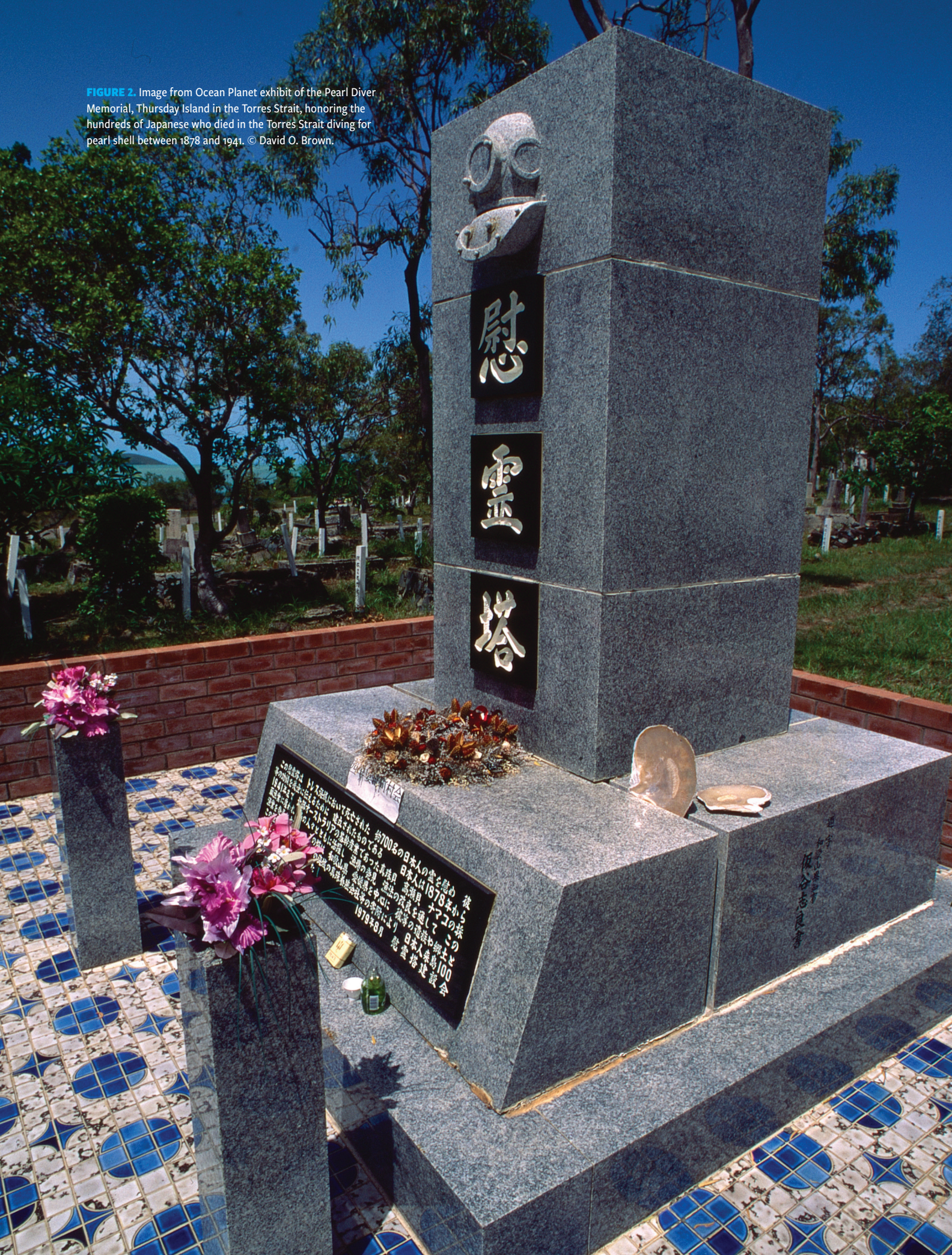
FIGURE 2. Image from Ocean Planet exhibit of the Pearl Diver Memorial, Thursday Island in the Torres Strait, honoring the hundreds of Japanese who died in the Torres Strait diving for pearl shell between 1878 and 1941.