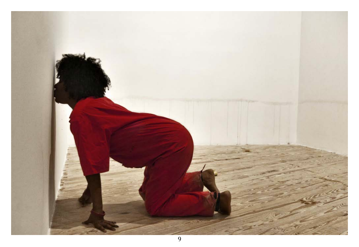
Tameka Norris, Untitled, 2012. Blood, lemon, saliva.

With a body that carries a collective memory –of rape, disenfranchisement, and materialized subjectivity and ambiguity between the private and public– that has been repeatedly been beat down, forgotten and shoved into the private abyss, Tameka Norris,