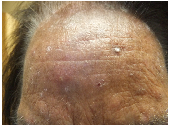
Figure 1. Ofuji disease. Multiple scaly erythematous papules and one pustule coalescing into a larger plaque on the forehead.

On physical exam, her face had an edematous, infiltrated appearance with multiple red-brown scaly papules and plaques admixed with pustules. Her chest had similar perifollicular papules and pustules. Laboratory values were remarkable for IgE of 2079 and complete blood count with 20.9% eosinophils.