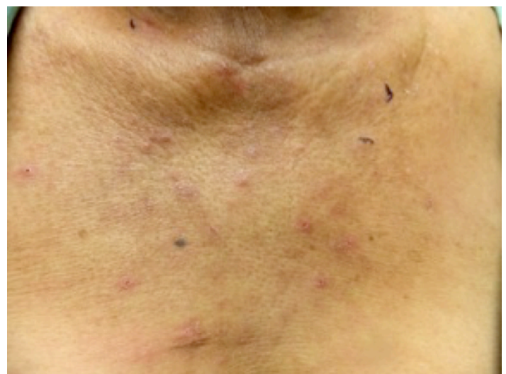
Figure 2. Ofuji disease. Scattered perifollicular scaly erythematous papules and pustules, few with excoriation on the chest. Pen markings indicate biopsy sites.