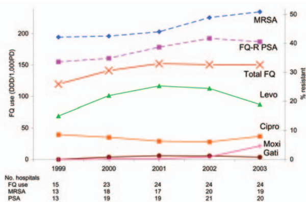
Figure 1. Fluoroquinolone use and resistance over study period. FQ, fluoroquinolone; Levo, levofloxacin; Cipro, ciprofloxacin; Moxi, moxifloxacin; Gati, gatifloxacin; DDD/1,000PD, defined daily doses/1,000 patient-days; FQ-R PSA, fluoroquinolone-resistant Pseudomonas aeruginosa ; MRSA, methicillin-resistant Staphylococcus aureus .

Table 3 shows the results of population-averaged GEE models using data over the study period from 2000 to 2003. The data from 1999 were not used as an outcome variable because of the lagged resistance term used in the model. After adjusting for the previous year's percent resistance, fluoroquinolone use was generally associated with a small and nonsignificant effect on percent resistance in a given year for either pathogen. Levofloxacin did display a significant contribution to percent resistance in MRSA; the coefficient of 0.012 suggests that an additional 100 DDD/1,000PD would lead to a 1.2% increase in percent MRSA over the previous year ( p = 0.033 ).