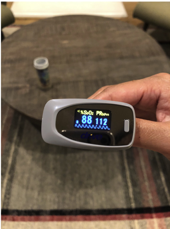
Figure 1. Initial pulse oximeter reading showing tachycardia to 112 beats/min and hypoxia to 88% with patient breathing room air.

A 42-year-old woman with no medical history developed diarrhea, followed by dry cough, severe myalgias, mild exertional dyspnea, and fatigue in March 2020 after a trip to Cancun with a layover in Mexico City. The patient and her husband, both emergency physicians, suspected that she had contracted SARS-CoV-2. They used a thermometer, a borrowed portable pulse oximeter, a portable ultrasound machine, and a home serology test to confirm the diagnosis.