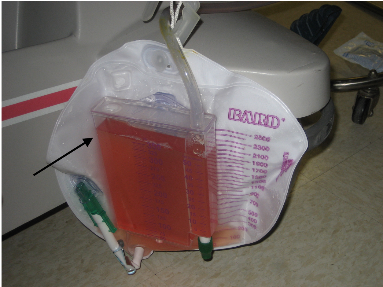
Image 3. Gross hematuria seen three hours after rapid bladder decompression.