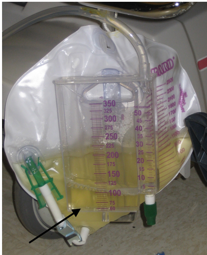
Image 2. Initial drainage of the bladder demonstrated clear urine.

A systematic literature review of related studies published from 1920 to 1997 found no cases of hematuria severe enough to necessitate further invasive therapy, such as bladder irrigation or blood transfusion. 1 However, a 2012 case report details a rare patient with severe hematuria