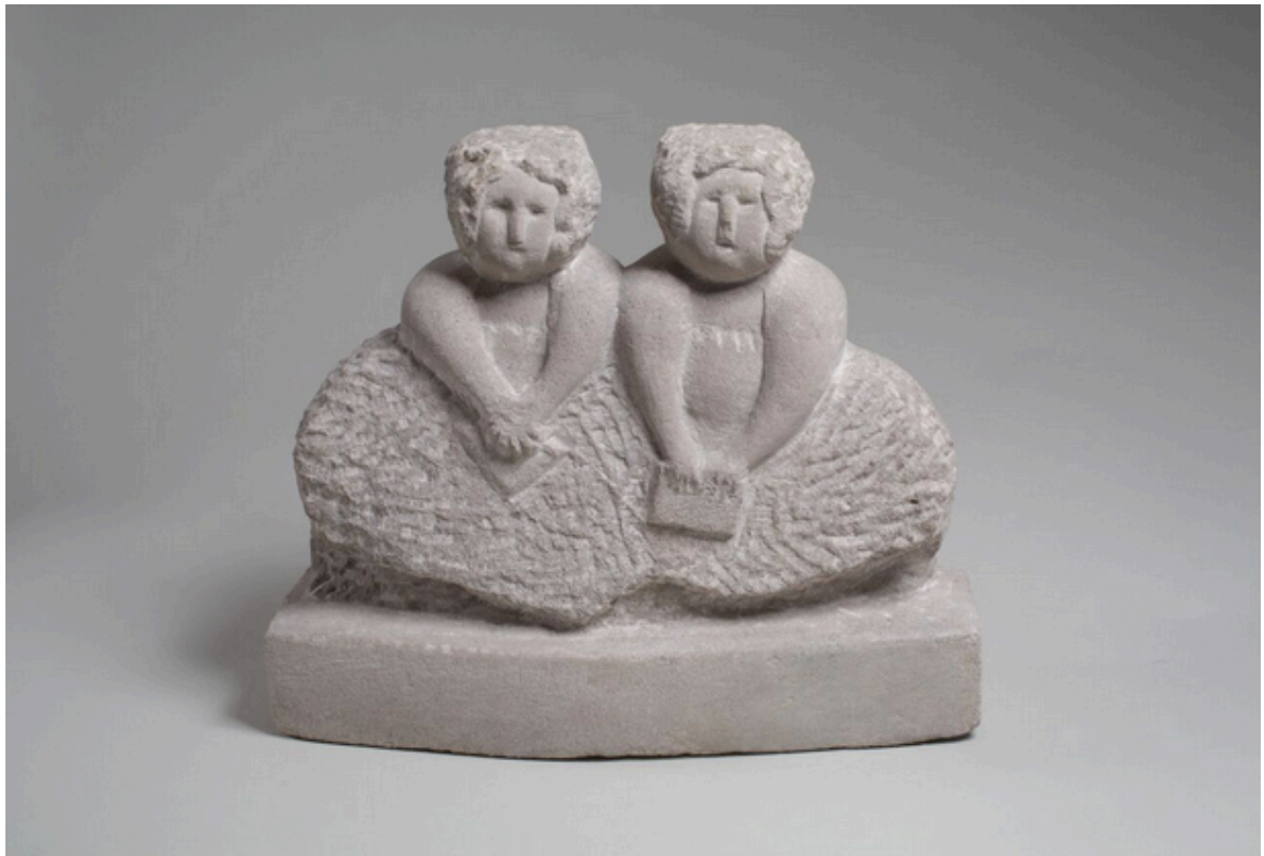
Figure 4. William Edmondson’s Mary and Martha (c. 1930-1938).

In the rooms of the Musée du Jeu de Paume, artworks shown together became an artistic group—a linear narrative—through intellectual categories conceived by MoMA’s curators. For example, Edmondson’s Mary and Martha (see Figure 4 5), with prominent chisel marks of two sisters holding prayer books, ceases to be a display of process that connoted a biblical story when placed beside the portrait Child with Dog , the joyful genre scene captured in The Quilting Party —both by unknown painters—and Joseph Pickett’s Coryell’s Ferry in 1776 (see Figure 5), which depicted a revolutionary battle scene. Now, just as Barr had hoped, the viewer joined the two young girls Mary and Martha with Child at a quilting party, with Coryell’s setting the stage for the festivities to form a definition of rural American culture as inviting. This was in stark contrast to the perceived brutal frontier environment of the United States’ western edge during the late eighteenth and early nineteenth centuries. This re-envisioning of the social experience during the early national period incorporates four artworks, crosses three centuries, and traverses the mid-Atlantic to achieve its meaning.