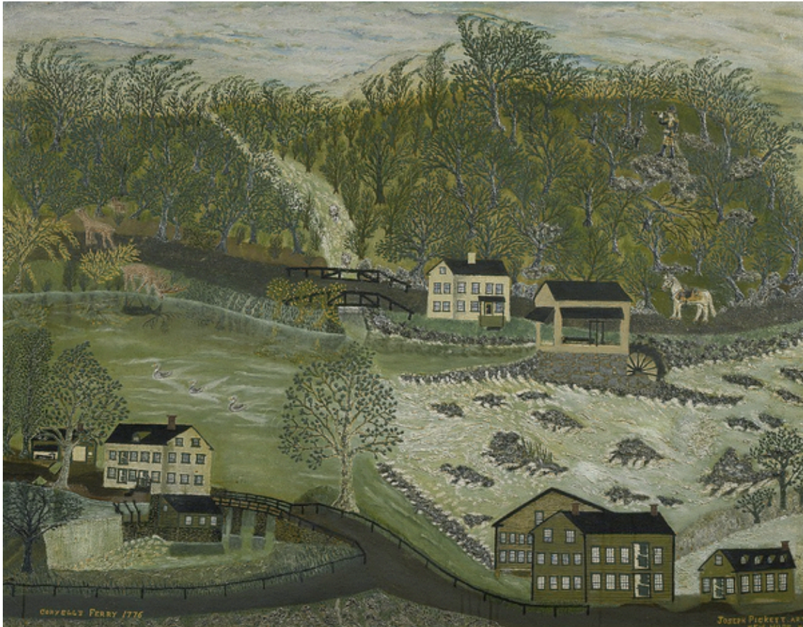
Figure 5. Joseph Pickett's Coryell's Ferry in 1776 (1914-1918).