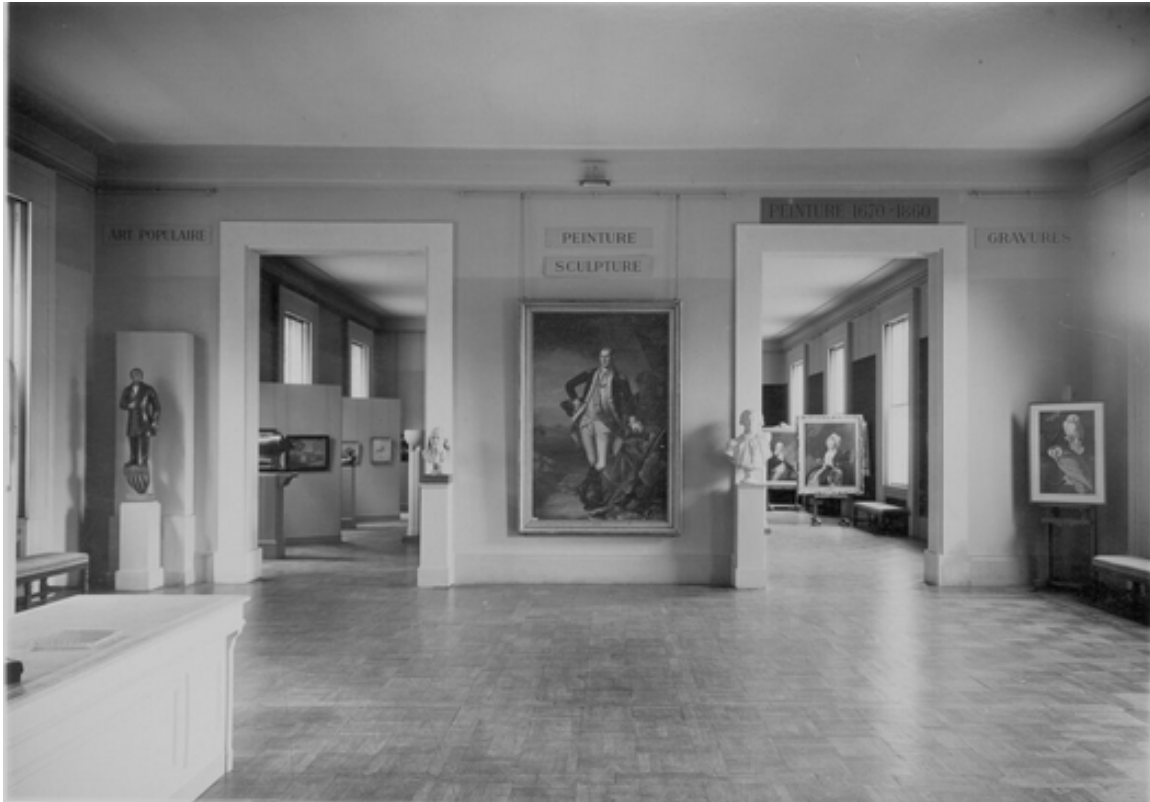
Figure 3. Entry installation photograph, Three Centuries of American Art (1938).

century painting and sculpture and the folk and popular art. After climbing the grand stairs to the second floor, visitors would have encountered photography as well as nineteenth-century and contemporary painting, sculpture, drawing, and prints. The chronological organization of the exhibition created a teleological view of American art in which contemporary art developed from the previous centuries. Thus, MoMA's American art history had its origins in the mid-sixteenth century—before the country had even been founded.