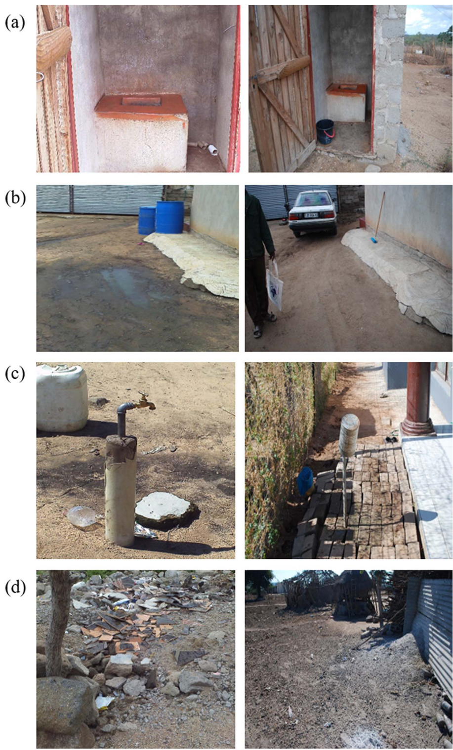
Fig. 2. a–d. Photographs depicting high-risk practices or interfaces before and after risk mitigation. (a) Bucket with water is made available in the toilet area for hand-washing, (b) Standing water is removed near the house to reduce mosquitoes, (c) A water tap is covered to reduce contamination from animals, (d) Building materials and debris are removed from around the house to reduce risk of vectors and vermin.

formed in health program evaluations [33]. Results from this study highlight a need to consider gender in the design, implementation, and evaluation of community-based health promotion interventions to help optimize outcomes for men and women. Given the significance of gender as a predictor of knowledge acquisition, investigators are currently involved in a follow-up study to further evaluate roles and