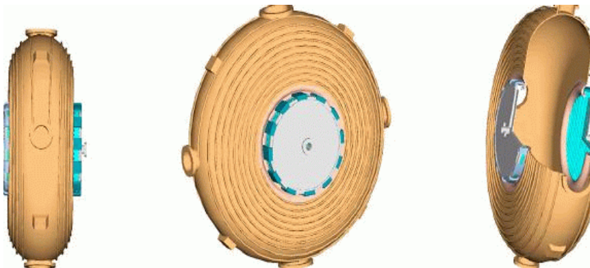
Figure 2. Conceptual design of the 201 MHz cavity.

foils was chosen so that the temperature rise at the center is below that at which the foils buckle. Table 2 lists main parameters of the cavity. The cavity design was performed using