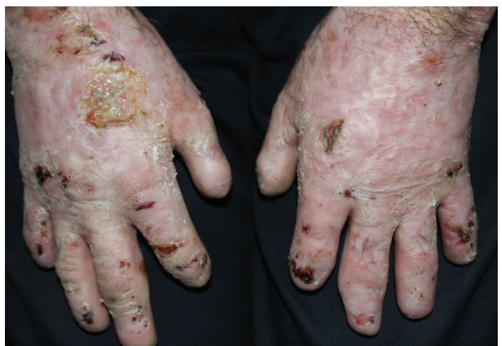
Figure 2. Clinical photograph of patient depicting shortening and scarring of fingers.