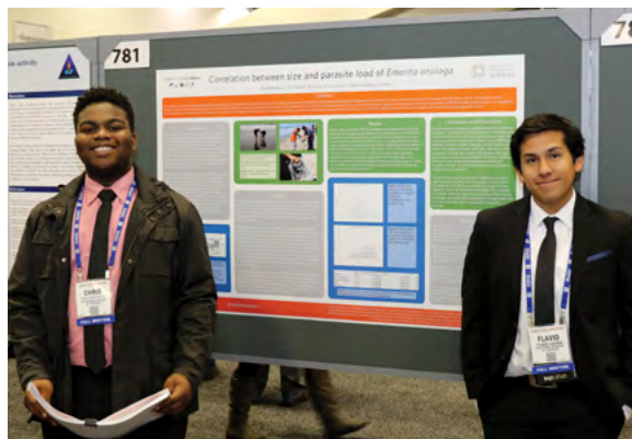
These high school students are presenting their findings at a scientific conference.

Every Thursday after school, from September through November, a group of three high school students worked together, preparing a research poster for a large international scientific conference, which is attended by thousands of professional scientists. As part of a summer internship at a local science museum, these young people had collected and submitted data about Pacific mole crab ( Emerita analoga ) to the Long-Term Monitoring Program and Experiential Training Program for Students (LIMPETS), a regional citizen science project that monitors the abundance and distribution of the Pacific mole crab along the coast of California. They were nervous and excited as they prepared to present their research about the prevalence of a parasite ( Profilicollis altmani ) in the Pacific mole crab.