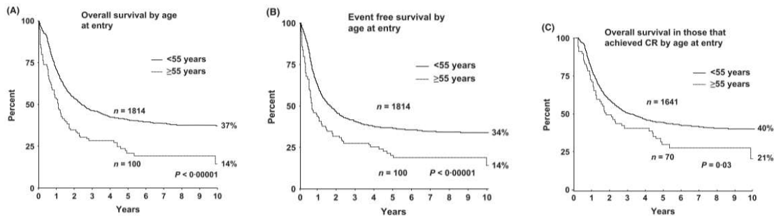
Figure 2: . Survival of patients by age at entry to study showing (A) overall survival and (B) event-free survival in all patients and (C) overall survival in those who achieved complete remission.

the older group - the OS for older groups is 30% compared to 44% of the younger group (Sive, 2012). In the aspects of treatment, there are significantly more incidences of drug reductions, omissions, or delays in the older group in phase 1 - such rates for the older group is 30%, compared to the 15% in the younger group).