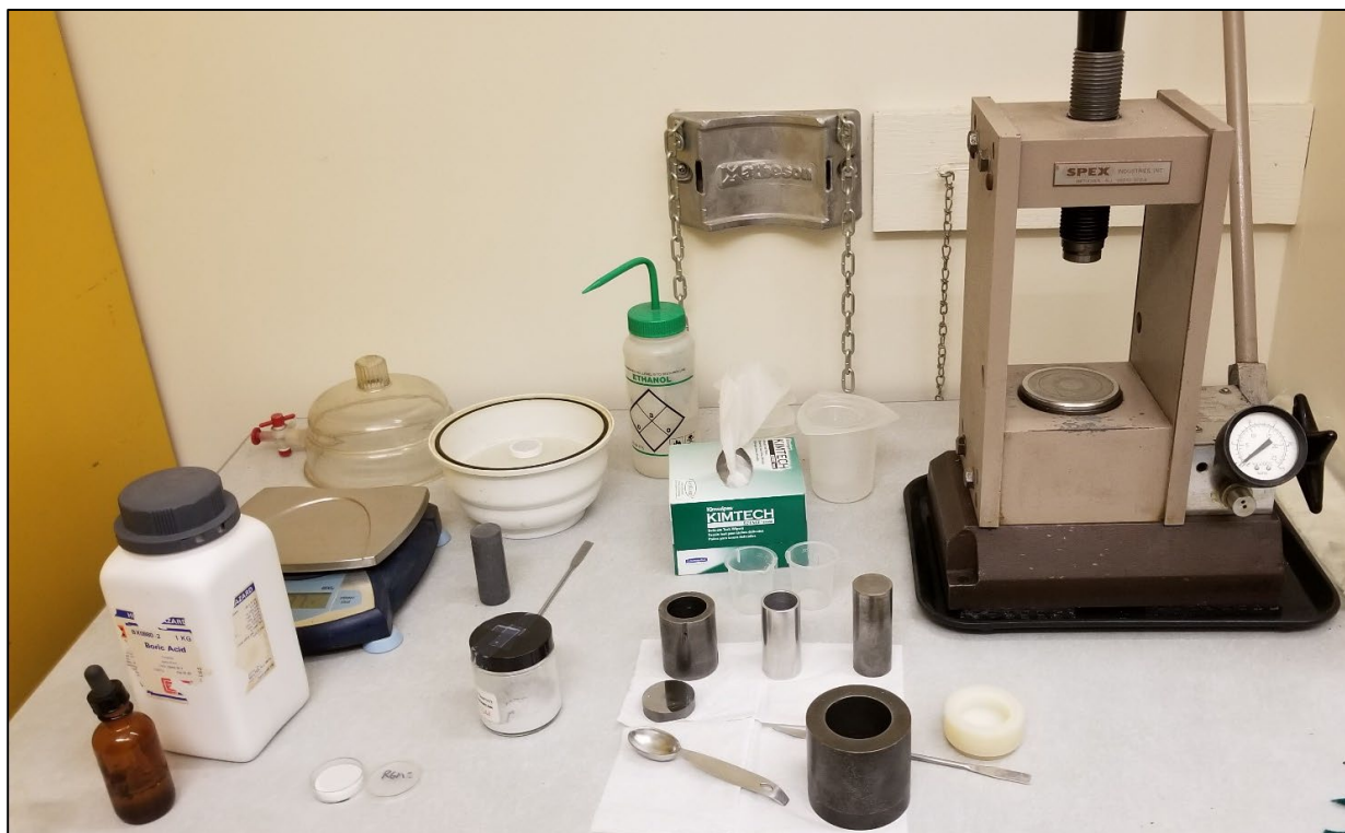
Figure 1. Spex press and supplies used for producing pressed powder pellets.