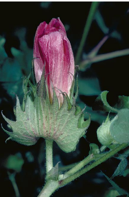
Far left, a cotton harvest and, left, cotton flower.

For the cotton survey, growers were randomly sampled from agricultural commissioners' lists taken from 11 counties in the three major cotton-growing regions of California — the San Joaquin Valley (Fresno, Kern, Kings, Madera, Merced and Tulare counties), Sacramento Valley (Colusa, Glenn and Sutter counties) and southern desert (Imperial and Riverside counties). A prescreening process reduced the initial sample of 1,009 growers to a usable sample of 845 eligible growers. To keep the questionnaire at a reasonable length, this sample was split in half. One half of the sample received a questionnaire that included questions about insect and mite management, and the other half received one with questions about disease, nematode and weed management.