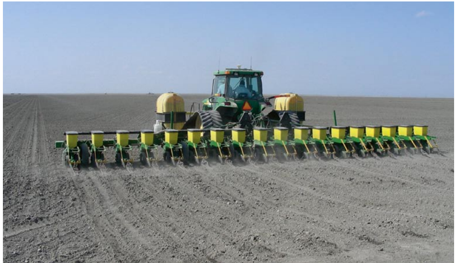
Integrated pest management is a strategy for controlling crop pests that combines a range of environmentally beneficial and economically sound techniques. In cotton, this may include choosing herbicide-tolerant varieties or adjusting planting times to maximize plant emergence and vigor.

Spider mite treatment thresholds. Spider mites are small arthropods that are difficult to count and easy to miss. UC IPM supported the development of a presence/absence sampling methodology that was easy to learn and use, and that standardized mite data for the first time (Ohlendorf et al. 1996). Results were presented as percentage of infested leaves in a field. When asked at what level of mite infestation they treat, 51% of growers preferred to treat when