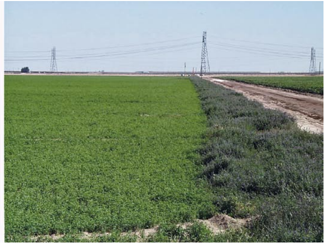
In this survey, only about 4% of responding California cotton growers reported using biologically intensive practices such as, left , interplanting with alfalfa or, right , planting buffer strips to provide alternate habitat for pests and beneficial insects.

However, many growers did indicate that they understood the importance of selecting herbicides based on their ability to target the specific weeds present in their fields. A large majority (94%) reported selecting herbicides based on weed species location and density, suggesting that they did monitor more informally and were aware of which species occur in which areas. This suggestion is further supported by a 1996 survey, which found that 72% of cotton acreage nationwide is scouted for weeds, even though mapping occurs on only 5% of acreage where just preemergent herbicide is used (and where mapping is most needed) (Fernandez-Cornejo and Jans 1999).