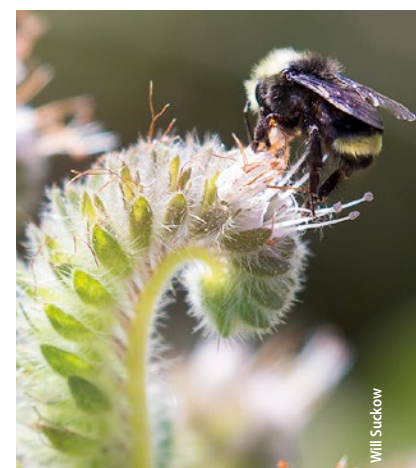
Above, bees visit wildflowers in a hedgerow: a honey bee on elegant clarkia ( Clarkia unguiculata ) and a bumble bee on California phacelia ( Phacelia californica ).