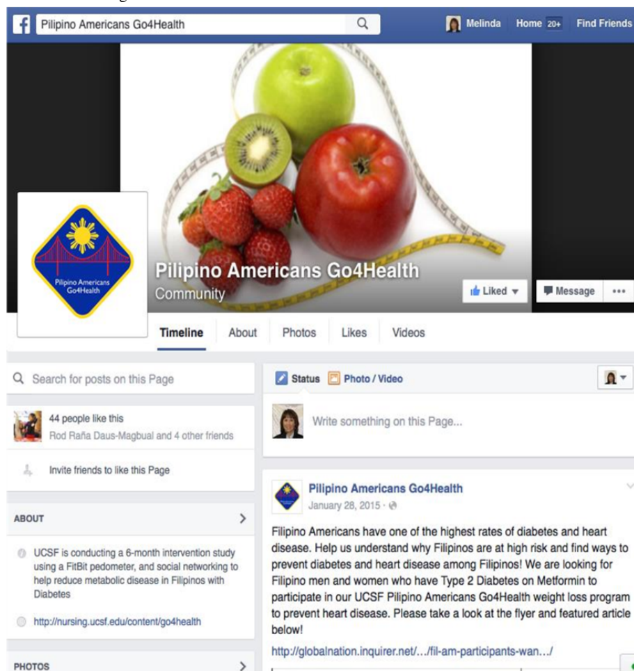
Figure 2. PilAm Go4Health Facebook Page.