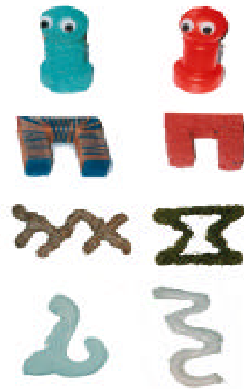
Figure 1: Stimulus items used for the training sessions.