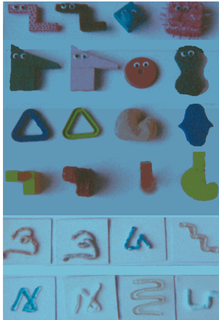
Figure 2: Stimulus items used for the test trials.