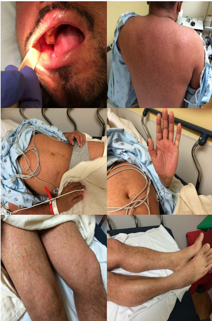
Figure 4. Measles rash and Koplik spots in an adult male.

age. A prodrome of fever, headache, abdominal pain and myalgias can be subclinical. In these atypical presentations, the rash can be macular, vesicular, petechial, or urticarial and can begin on the hands and feet and spread centripetally. When atypical measles was first reported in the late 1960s and early 1970s, it was often mistaken for Rocky Mountain Spotted Fever.