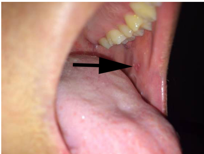
Figure 2. Koplik spots.

The rash of measles generally erupts about 14 days after exposure, which is usually 2-4 days after onset of symptoms. Unlike rashes of some infectious diseases that start on the lower extremities or trunk, the rash of measles begins on the face and progresses cephalocaudally to the torso and extremities. Thus, assessing the pattern of rash evolution is essential to identify measles patients. Erythematous macules and papules coalesce into patches and plaques within about 48 hours (Figure 3).