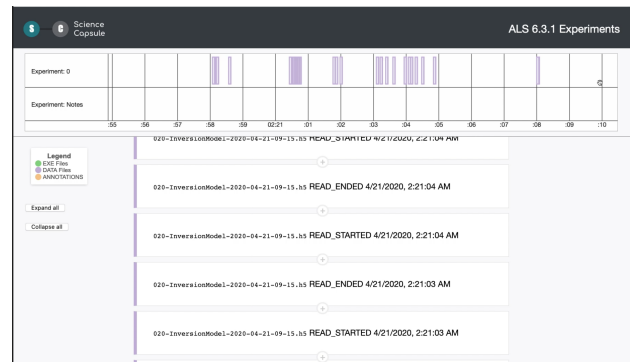
Fig. 3. The Science Capsule user interface displays a timeline of events captured while allowing users to add notes and images for later use when revisiting their work.

provenance generated by Science Capsule helps users make their analyses more reproducible.