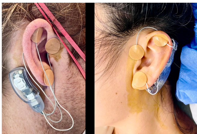
Figure 2 A percutaneous auricular nerve stimulation system (NSS-2 Bridge, Masimo, Irvine, California, USA). The pulse generator is adhered directly to the patient behind the ear over the mastoid process. Leads are placed (1) at the most cephalad portion of the antihelix; (2) immediately cephalo-anterior to the incisura and posterior to the superficial temporal arterial pulse; and (3) on the posterior ear opposite the antihelix at the level of the incisura. The ground electrode is inserted on the anterior side of the lobule (ear lobe).

The pulse generator was applied posterior and slightly caudad to the preferred ear (contralateral to the side on which the patient slept) with a double-sided adhesive pad which was further secured with a clear adhesive dressing. Each of three electrodes and a ground has a 2 mm long integrated needle(s) (figure 1) and is affixed with a small, round adhesive bandage (figure 2). 16 Specific lead locations on the outer ear were guided with transillumination to optimize effects and avoid placement