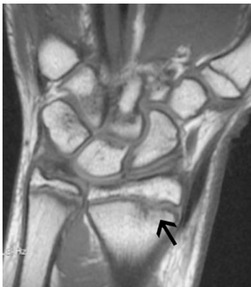
Fig. 1 Coronal T1-W MRI of patient 1, a 12-year-old girl with chronic physeal injury. The distal radial physis is wide and irregular. Note low-signal intrusions into metaphysis typical of focal failure of ossification of physeal cartilage (arrow)

Three girls had TFCC tears, one of whom had TFCC tears bilaterally. All were the central communicating type. Additional findings included stripping of the ulnar collateral ligament from its distal ulnar insertion in two patients. One patient also had a scapholunate ligament tear, with contrast agent passing through the scapholunate joint from the radiocarpal to the midcarpal compartment (Fig. 2).