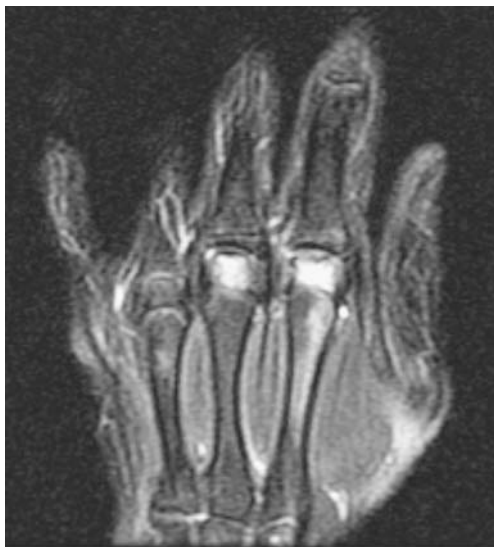
Fig. 4 Coronal T2-W MRI of a 14-year-old girl (patient 7). Flattening and bright signal of the second through fourth metacarpal heads consistent with osteonecrosis

Focal chondral injury to the lunate with a similar appearance to that of our two cases has been described by Earp et al. [21] in association with a scapholunate ligament tear. In our one surgically explored case the scapholunate ligament was abnormal but intact and no abnormal motion was demonstrated at the joint. Because the articular cartilage over the area had a reticulated appearance and the ligament was described as abnormal, it is likely that this represents an osteochondral injury in association with a scapholunate ligament injury. Our second case of focal