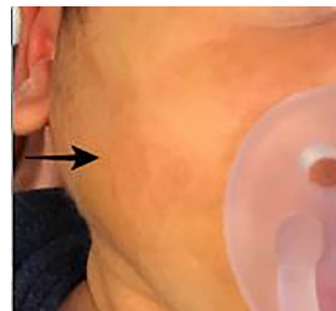
Image 1. Black arrow shows swelling and erythema over the right side of the face in neonate with suppurative parotitis.

In the ED, the patient was afebrile with normal vitals for his age. On exam, he had right facial redness and crying with palpation of the right cheek (Image 1). The left side was normal. The right tympanic membrane could not be visualized due to edema. Oral mucosa was normal, but purulent material was seen coming out of the mouth. When parotid massage was performed more purulent material was expressed inside the mouth from