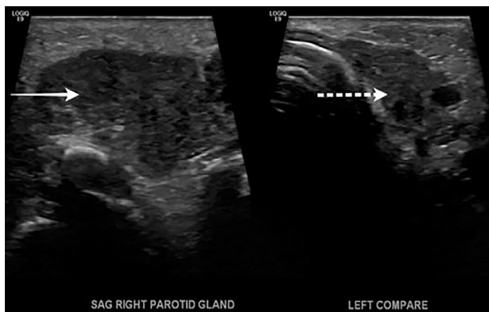
Image 2. Parotid point-of-care ultrasound: swollen right-side parotid gland (solid white arrow) compared to the left-side parotid gland (dotted white arrow).

levels (Table 1). A respiratory panel was obtained and was negative. A point-of-care ultrasound of the soft tissue, head, and neck was performed, which showed a swollen, hypervascular right parotid gland likely representing changes of parotitis. There was no evidence of ductal dilation, obvious calcification shadowing, or changes to suggest abscess (Images 2 and 3). This was the main contribution to the diagnosis. Ear nose throat (ENT) and infectious disease specialists were consulted from the ED and agreed with the diagnosis. Even though the baby was afebrile, he received a full septic