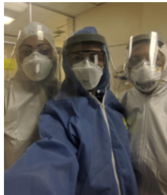
PPE for MGH and TGH included a full suit with double masks and double eye protection

Nurse volunteers from UCSDH 3GH/CVICU and Sharp Chula Vista Medical Center (SCVMC) provided reinforcements of the education and training with TGH staff over the next 4 weeks. In total, over 40 nurses joined the cross-border collaboration to help TGH nurses care for patients and improve outcomes.