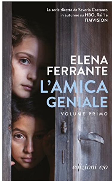
Fig. 2. L'amica geniale (e/o)