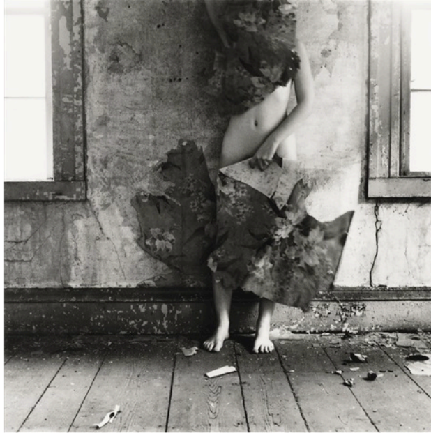
Fig. 4. Francesca Woodman, From Space 2 , Providence, Rhode Island, 1976. Gelatin silver print. © 2020 Estate of Francesca Woodman / Charles Woodman / Artists Rights Society (ARS), New York. This image is not covered by this article's CC BY-NC license.