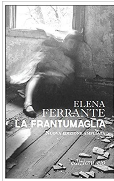
Fig. 1. La frantumaglia (e/o)

technique was time exposure, which had the effect of blurring and diffusing her figures, thus making them appear as evanescent and ethereal. 5