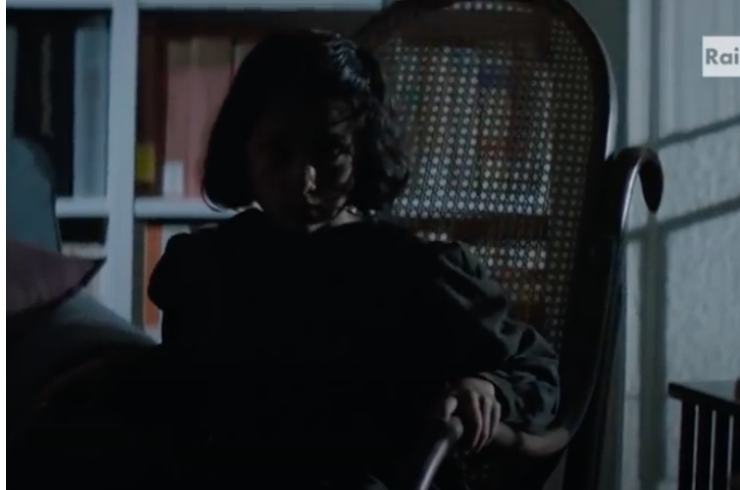
Fig. 10. Saverio Costanzo, L'amica geniale , 2018. Still.

Hence, the double apparently does not split apart; rather, it is explored in-depth and enigmatically brought to light and staged on the screen. Indeed, by framing the entire TV series, the prologue, co-written by Costanzo and presumably Ferrante, conveys a subliminal message, which unveils the resilience of a feminine subject that on the verge of dissolving can claim “io non ci sto” (“I’m not here”), while the “other woman” begins to write – and therefore renegotiate – the story of her new self. As Ferrante declares: