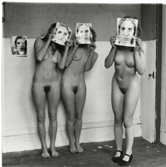
Fig. 5. Francesca Woodman, About Being My Model , Providence, Rhode Island, 1976. Gelatin silver print. © 2020 Estate of Francesca Woodman / Charles Woodman / Artists Rights Society (ARS), New York. This image is not covered by this article's CC BY-NC license.