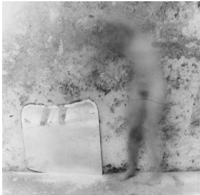
Fig. 6. Francesca Woodman, Self-deceit #7 , Rome, 1978. This image is not covered by this article's CC BY-NC license.