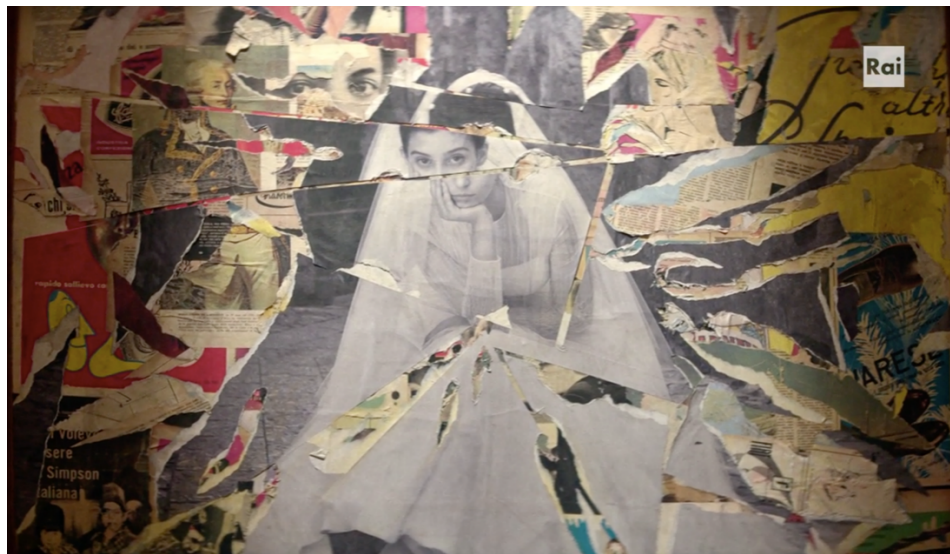
Fig. 3. Saverio Costanzo, L'amica geniale: Storia del nuovo cognome , 2020, Still.

This description of the photograph has been vividly portrayed in the Rai/HBO TV adaptation of Storia del nuovo cognome in the episode significantly titled “Scancellare” (“Erasure”), where Lila’s body appears mutilated and recomposed (fig. 3). In Lila’s aggressive collage, feminine self-refashioning takes shape through a process of self-erasure and self-fragmentation, that is, through a process of smarginatura . The photo, as “one of the Neapolitan Novels’ central visual metaphors of resistance against male focalization of the female body” (Wehling-Giorgi 2019, 76), seems to suggest that the only way a woman’s body can eschew the male objectifying gaze is to obscure itself beyond recognition. In this respect, Francesca Woodman is summoned once again, as Lila’s manipulated portrait is reminiscent of the American artist’s haunting pictures which function as photographic metatexts within Ferrante’s writing.