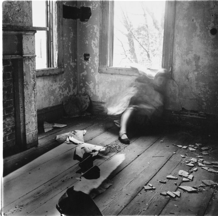
Fig. 7. Francesca Woodman, House #3 , Providence, Rhode Island, 1976. Gelatin silver print. This image is not covered by this article’s CC BY-NC license.

smarginatura since the “dissolving margins” are ultimately “un’affacciarsi sul tremendo” (LF, 363; “When shapes lose their contours, we see what most terrifies us” [F, 373]). Strikingly, the scene is reminiscent of Woodman’s picture of herself as a young girl in the act of falling or jumping out of a window (fig. 7, displayed on the book cover of La frantumaglia ). Woodman’s gloomy, black-and-white pictures with decaying backdrops are recalled vividly in the cinematic setting of L’amica geniale with its depiction of Naples’ grim, grey-toned outdoors and decrepit, claustrophobic interiors, thus representing another instance of transmedia cross-reference encompassing fiction, photography and cinema/television.