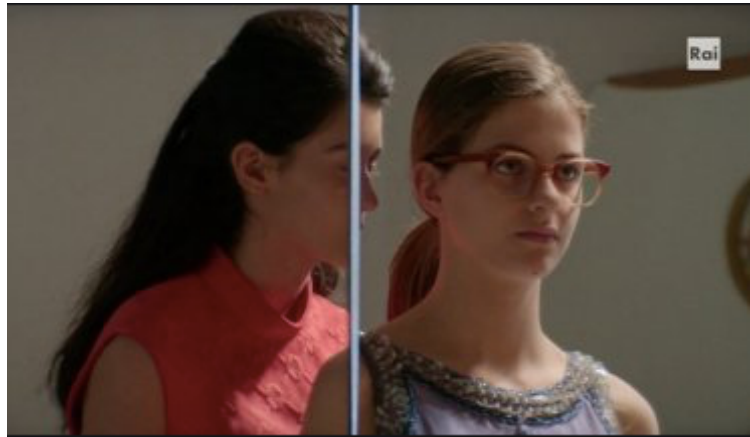
Fig. 8. Saverio Costanzo, L'amica geniale: Storia del nuovo cognome , 2020, Still.

side. 27 The sequence that frames Lila and Stefano’s first night of their honeymoon represents a horrific climax in this sense; the shot preceding the scene in which Stefano rapes his reluctant wife shows his face monstrously deformed as it appears multifaceted through the glass door of the bathroom where Lila is hiding. Costanzo successfully manages to represent Ferrante’s portrayal of smarginatura as strongly inflected by a gender perspective. When it refers to Lila’s perception of certain male bodies it takes on the features of disfigurement, deformity, brutality, and monstrosity; when it is identified as a self-perception (always female), it is portrayed as a form of fragmented self. 28 Interestingly, during the viscerally frightening scene of sexual violence, a strategic perspective shot brings the viewer directly into Lila’s viewpoint as she lies on the bed like a dead, inanimate body in order to withstand the abuse, and in so doing she stages a sort of dissociated being. Her imaginary dissolution from herself and the surrounding world – her smarginatura – is indeed a subtle form of dissent that will allow her to cross several boundaries within the oppressive confines of her multiple roles as wife, mother, lover, brilliant entrepreneur and exploited factory worker.