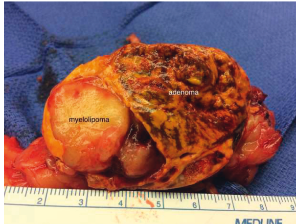
FIGURE 2: The surgical specimen demonstrates the characteristic macroscopic fat component of the myelolipoma with an adjacent well-circumscribed solid golden yellow adenoma.