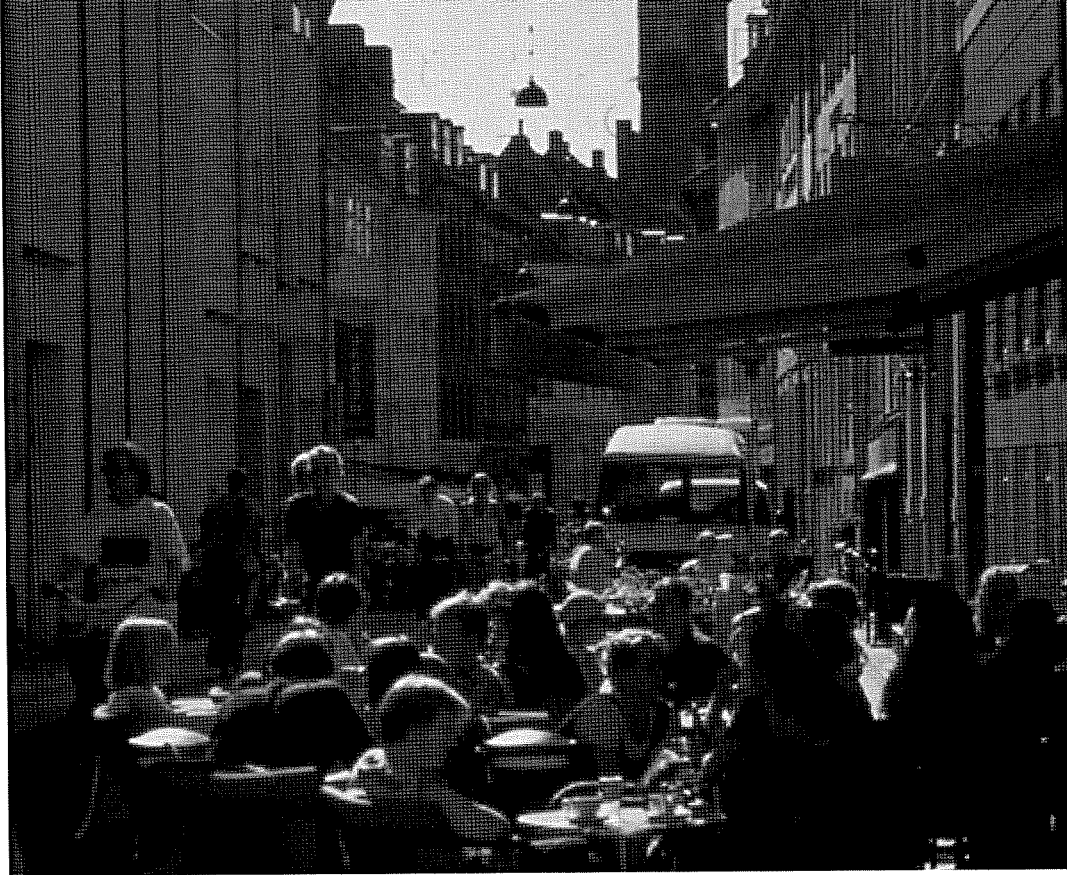
facing page, this page: Pedestrian-friendly squares and streets in Copenhagen. The Public Spaces, Public Life project involved systematic, long-term study that produced not only design solutions but also a body of knowledge and theory that can be applied broadly.