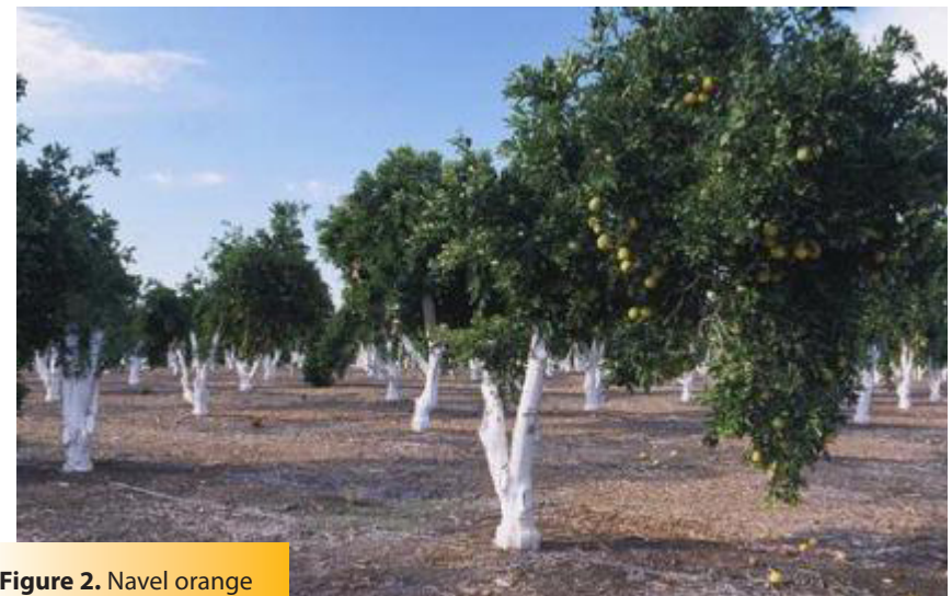
Figure 2. Navel orange trees skeletonized, whitewashed, and grafted.

Canopy sprays of kaolinite clay have shown some promise in reducing transpiration with negligible yield reduction (Skewes 2013; Wright 2000). If kaolinite clay is used, it should be done under the advisement that the packing house can remove the clay.