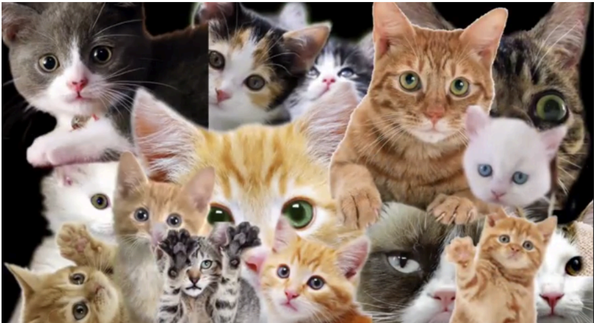
Figure 1.2: “Never Stop,” an ad featuring internet cat celebrities