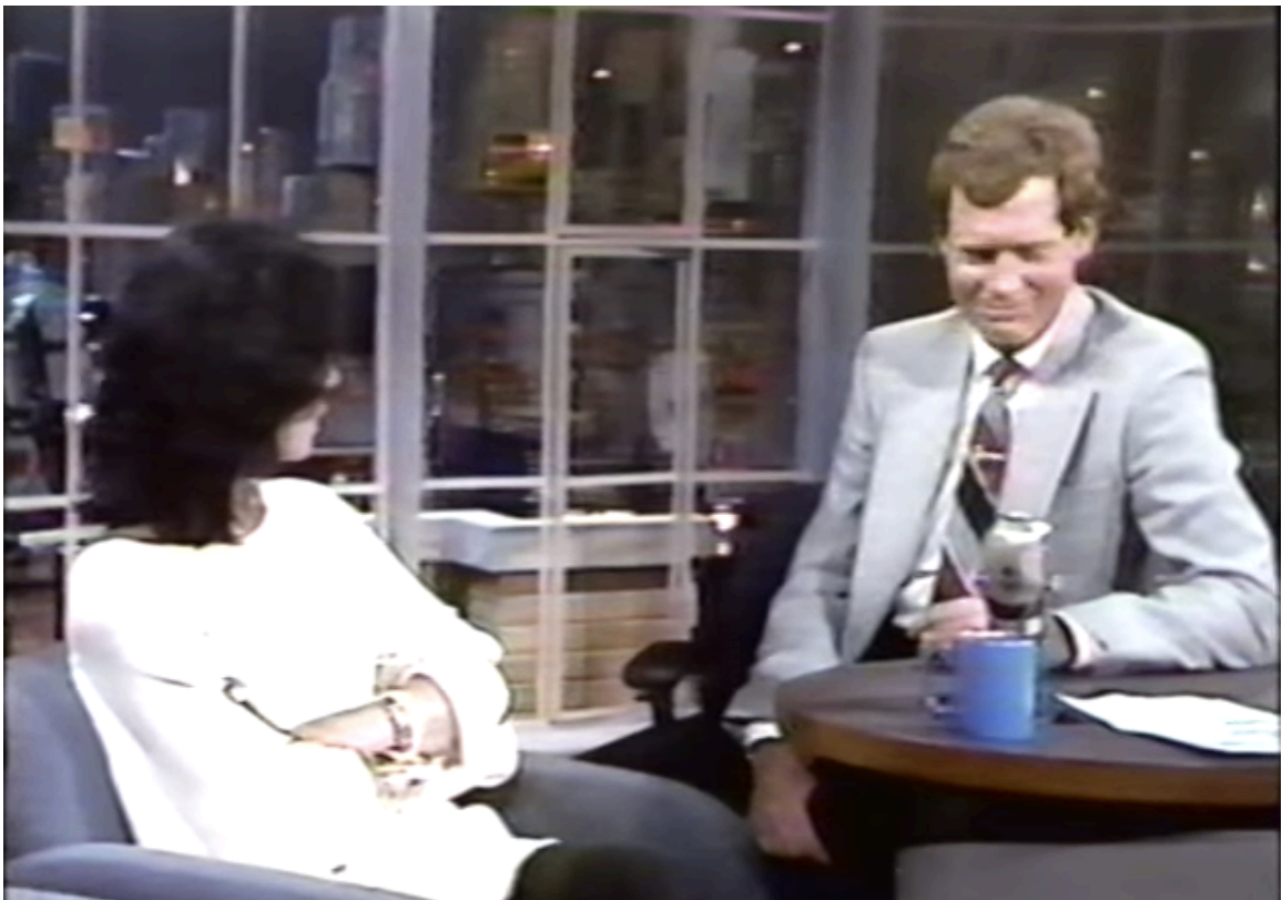
Figure 3.5: Cher defeats Letterman with a single word.