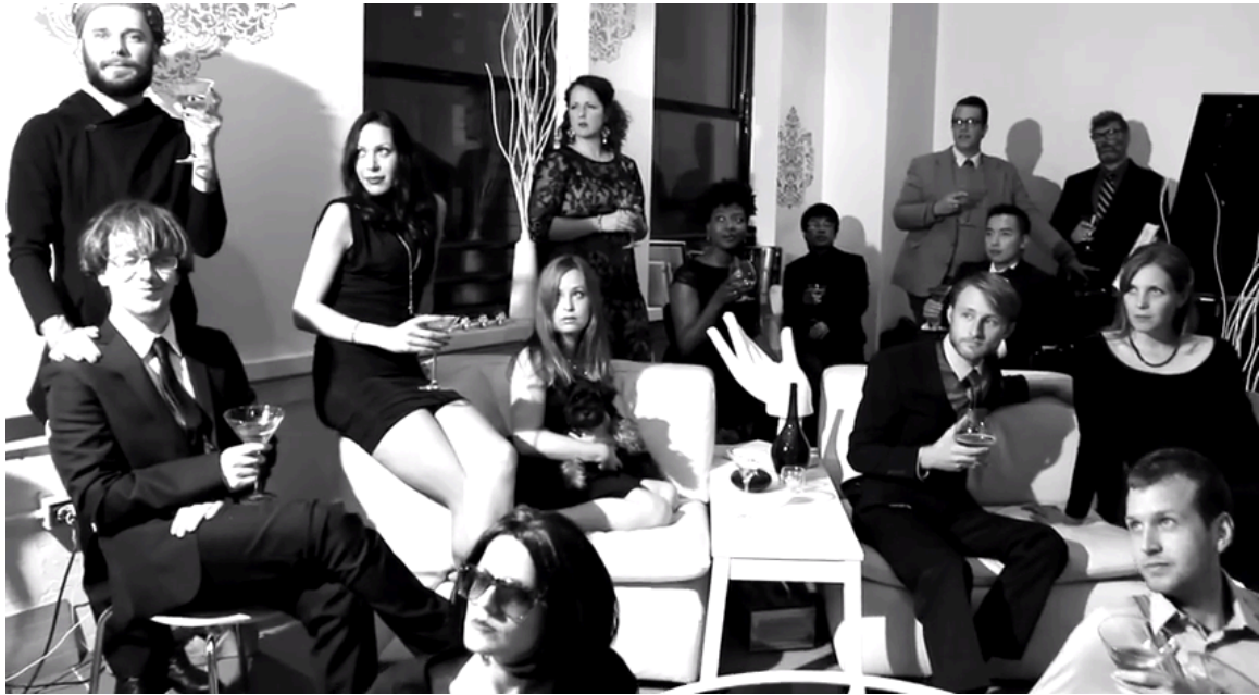
Figure 1.7: “Mystery,” the best way to poison your loved ones.

“Mystery” featured a swinging bachelor pad jingle that begged to be staged at Brendan’s spectacular downtown loft apartment. The product was a poison marketed to those who wanted to kill their lovers in a most dignified way. In the commercial, the product name is never revealed, but the action of people poisoning each other while at a sophisticated party is prominently featured. Of course, though, there’s a twist. At the tail end of a moving shot, the camera closes in on my face, at which point I open my eyes, wink and flash a mischievous smile.