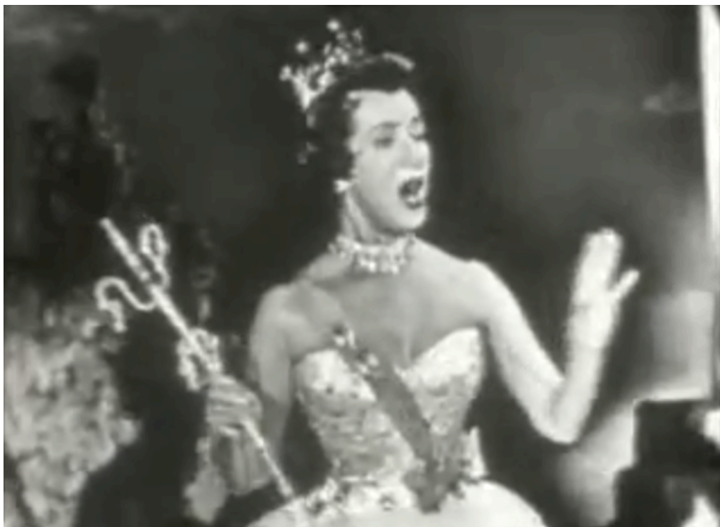
Figure 5.2: Lily Pons performing "Je Suis Titania" on the Ed Sullivan Show in 1956