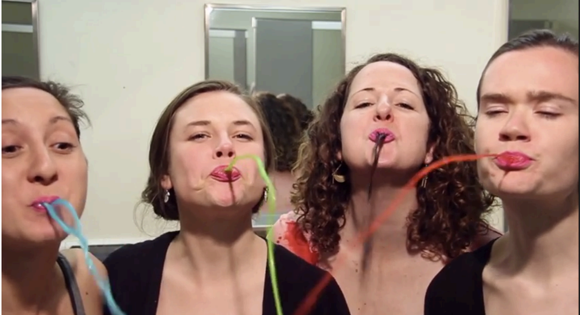
Figure 1.6: “Perfect Swish,” the mouthwash that changes color in your mouth.

perfect swish of your life!” The only image that came to mind was the nauseating teen B-movie horror films where the bad girls hang out in their safe space: the high school girls’ bathroom.