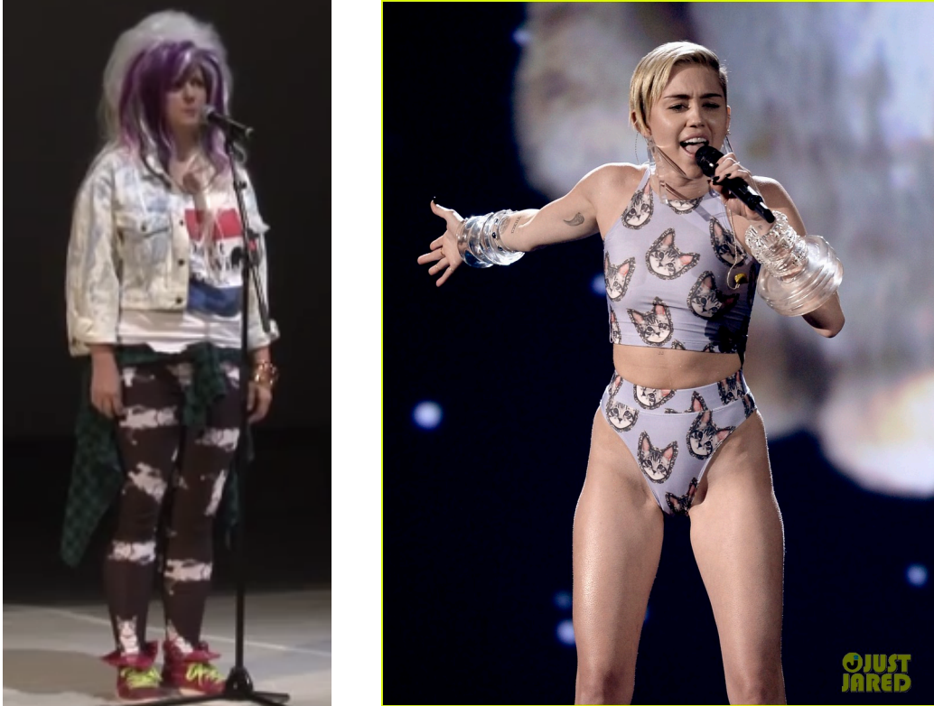
Figures 2.4 a and b: (L) Lindley's full get-up; (R) Miley Cyrus's cat outfit.