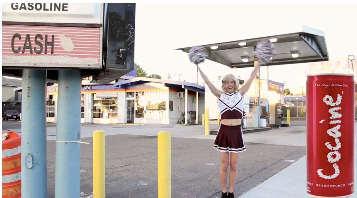
Figure 1.8: “Cocaine,” an energy drink.

“Cocaine” is the only commercial to feature a product that actually exists, though it has been officially pulled from retail shelves and is now only available online. The drink contains 280mg of caffeine per 8.4 fl. oz. can, which is the maximum recommended daily allowance for a healthy adult. 13 None of us on the production team of Vanity Run Amok have ever tried the drink, nor do we have any desire to do so, but when we were presented with a jingle that says, “maybe in a year you will drink some cocaine,” we couldn’t resist the opportunity to feature this highly un-recommended product.