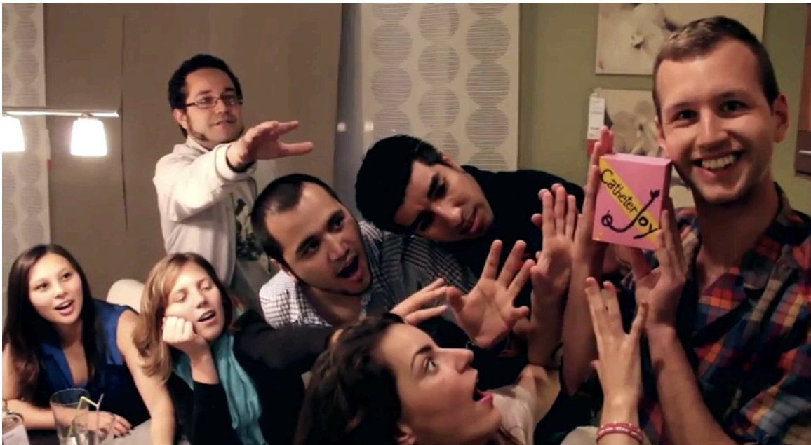
Figure 1.3: “Catheter Joy,” an ad for a male tampon

Catheter Joy is the male tampon you never knew you needed. We decided to take inspiration from a promotional film produced by General Motors in 1956 called “Design