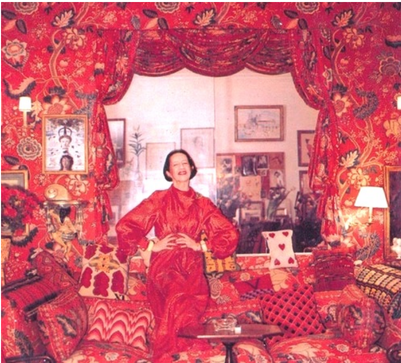
Figure 3.3: Diana Vreeland in her Manhattan apartment.