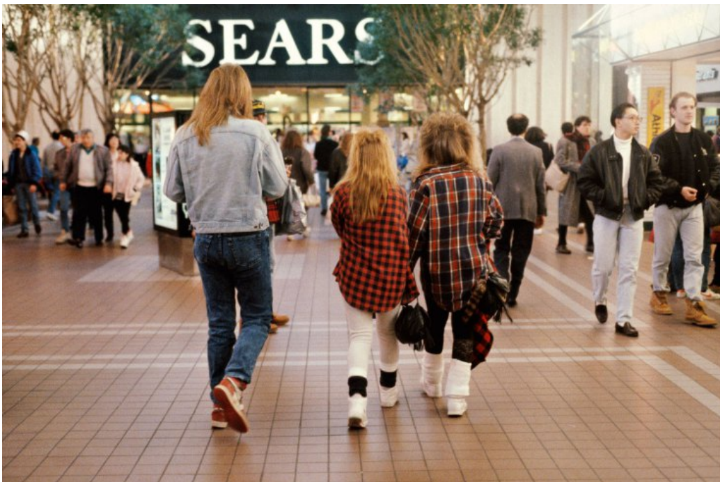
Figure 2.5: a group of mall patrons photographed by Michael Galinsky. 19