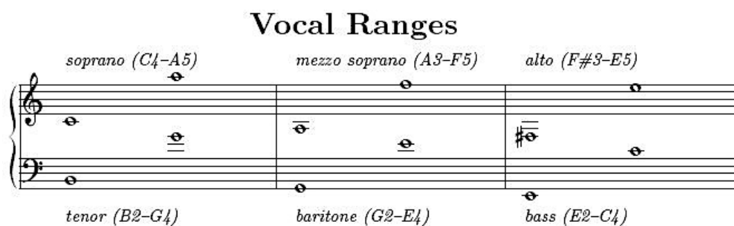
Figure 4.2: Vocal ranges of men and women.

The Ace Farren Ford songs are about a general feeling of emptiness, intense insecurity, and paralyzing fear of revealing too much. As such, the vocal writing mimics natural speech patterns and is scored in a range that is more closely related to my speaking voice, than my bel canto singing voice resulting in a sound more active and less sustained. As a mezzo-soprano, my comfort zone is right in the middle of the female voice and anything beyond that, while possible, is treated as an extension. I am not an alto, whose voices more comfortably exist in the lower-to-middle part of the female voice. While each of these voices can reach pitches above and below what is indicated, the image below shows the comfortable tessitura of the three types of female and male voices.