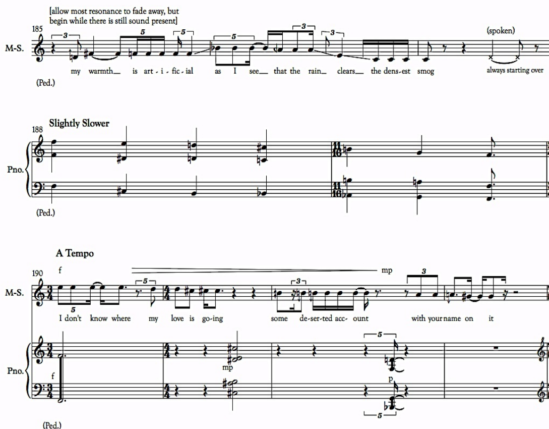
Figure 4.7: Excerpt from 5. why why not is not is

solo vocal line, followed by a succession of open chords that ends in the first sudden frustrated outburst of the entire piece: