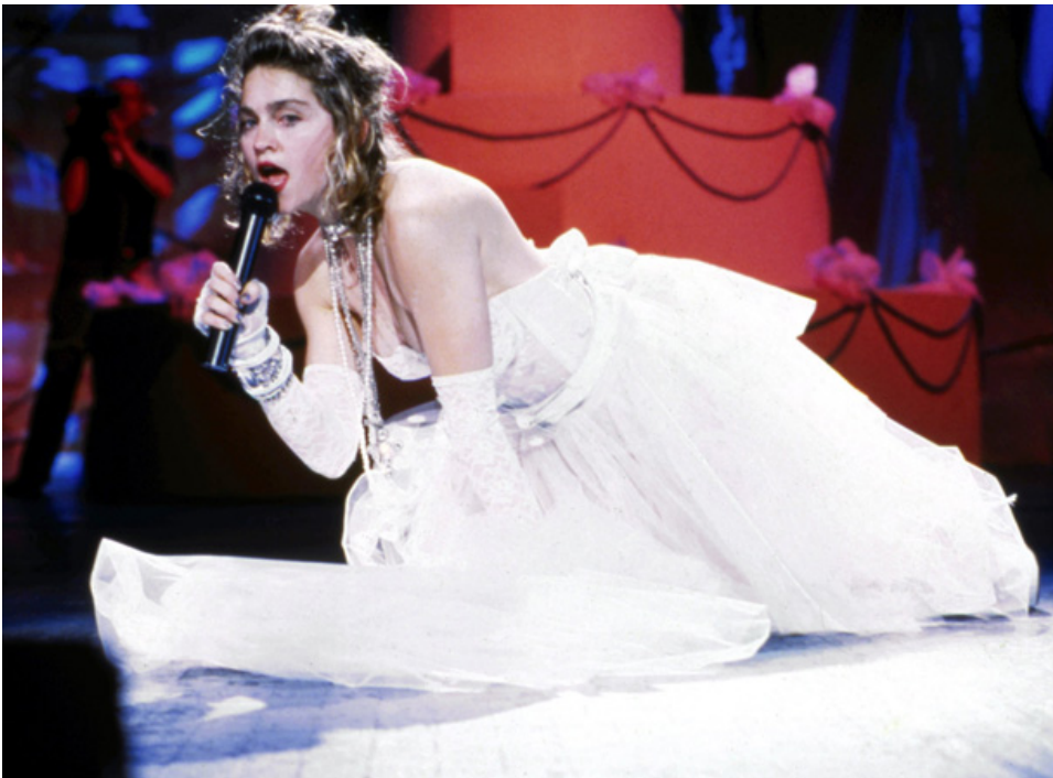
Figure 2.8: Madonna increases the intensity of her performance by collapsing to the floor at the VMA's in 1984.