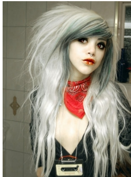
Figures 2.3 a and b: the photo on the right inspired Lindley's wig.