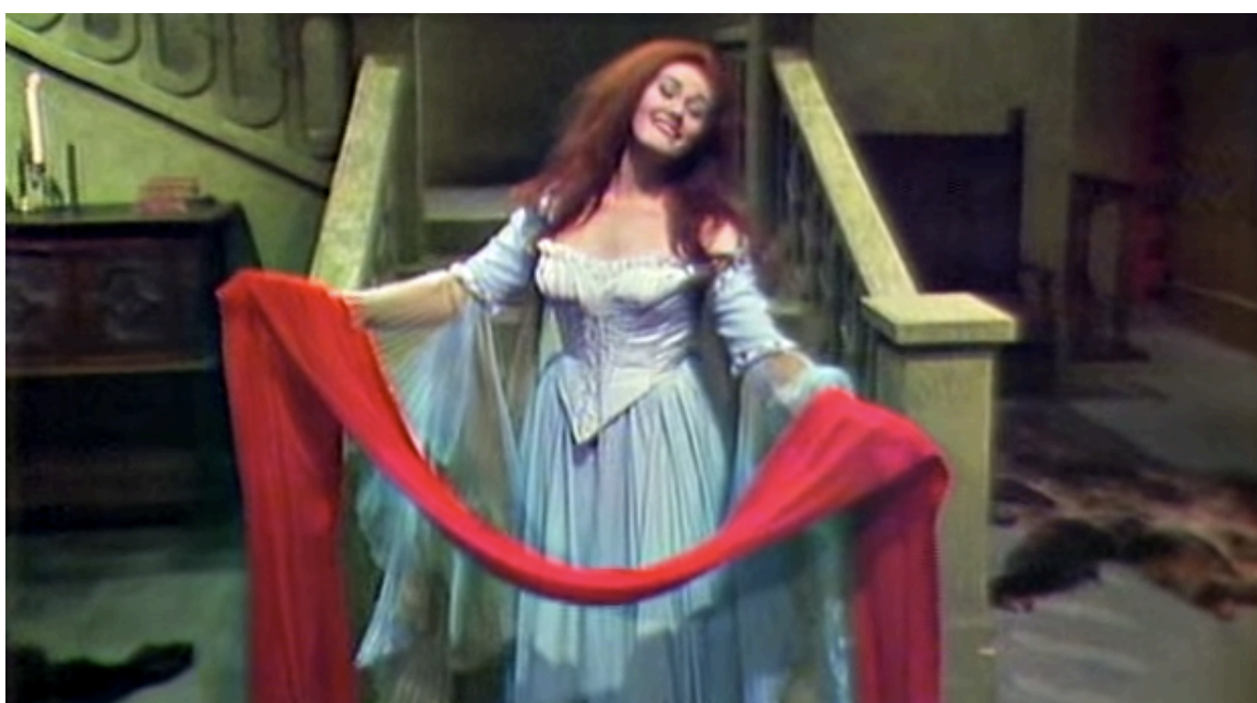
Figure 5.7: Joan Sutherland performs Lucia's mad scene from Donizetti's Lucia di Lamermoor on the Bell Telephone Hour in 1968.