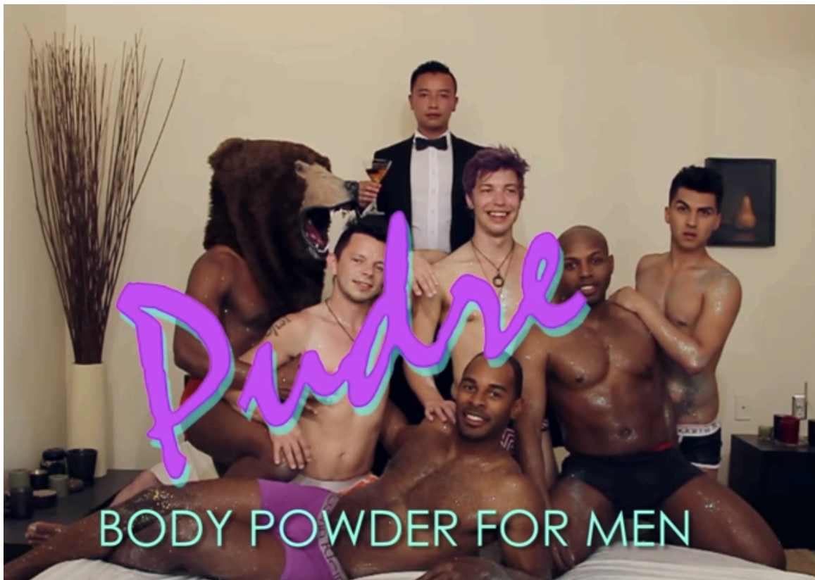
Figure 1.5: “Pudre” a male body powder that turns to glitter when it touches the skin.