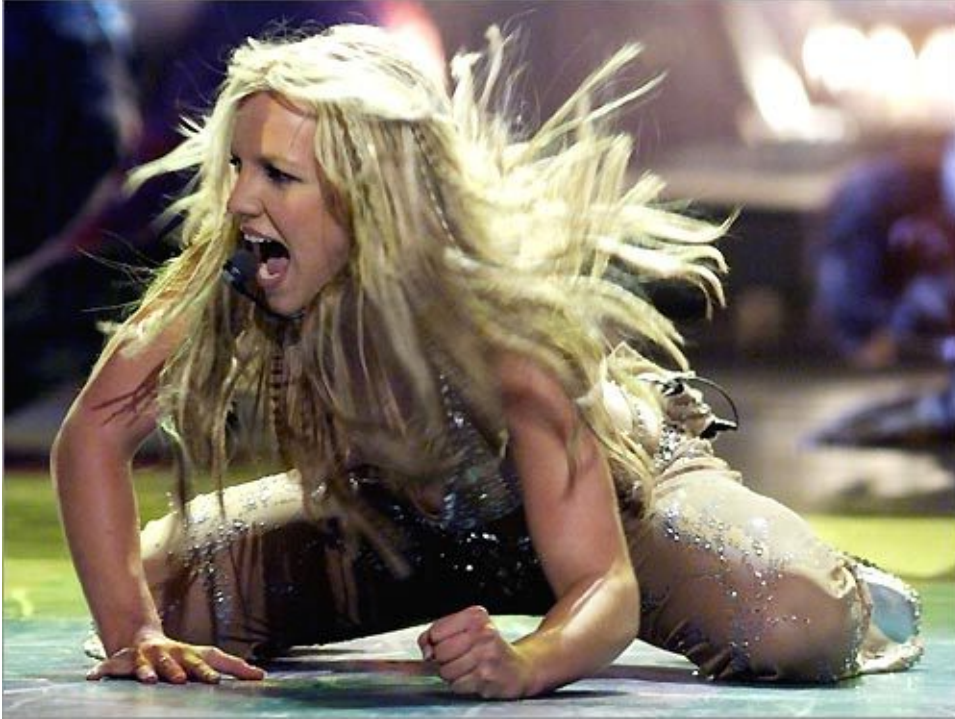
Figure 2.7: Britney Spears increases the intensity of her performance by collapsing to the floor at the VMA's in 2000.