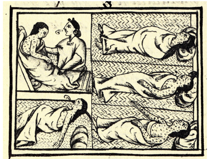
Figure 2. From the Florentine codex of Conquest-era Mexico. Smallpox proved to be among the most powerful weapons in the Spanish arsenal.

“Diseases helped cause Mexico’s population to fall from 20 million to about 1.6 million, a precipitous decline which cannot be attributed exclusively to the guns of the Spaniards.”