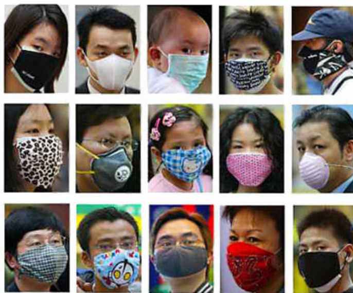
Figure 1. Increasingly intertwined global social and economic networks caused SARS to skyrocket to an international concern.

childhood is attributable to under nutrition,” which is in turn associated with economic standing in extreme cases (Roberts 2006). But following this logic to its reasonable end seems to indicate that, by the time the global human population has reached the apex of its economic development, infectious disease will simply no longer be an issue. Can we really count on that? The issue is complicated by two considerations; first, infections and plagues very often hinder development, either simply through reducing the workforce or more foundationally by weakening a specific sector of the economy, thereby rendering the very notion of a disease-free economic ‘apex’ unrealistic. Secondly, as we will see, development can indeed increase the susceptibility of a society to disease! In any case, it is clear that economics alone does not provide