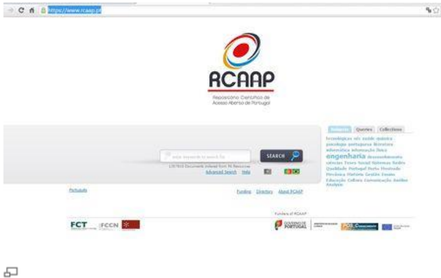
Figure 2: The Search Interface of RCAAP.

RCAAP portal is one of the main components from the project Repositório Científico de Acesso Aberto de Portugal . RCAAP project is an initiative from UMIC Knowledge Society Agency , developed by FCCN Fundação para a Computação Científica Nacional , with the technical and scientific support of Minho University . [6]